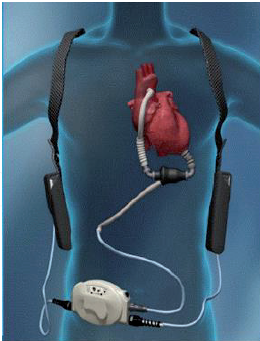
Figure 1. LVAD device.

“HeartMate” is one of the continuous flow systems which are driven by an axial turbine (HeartMate™ II, BerlinHeart™, Jarvik 2000™, DeBakey MicroMed™) or a centrifugal pump (HeartMate™ III). They are implanted by sternotomy or thoracotomy. The blood is taken from the apex of the LV and returned to the ascending or descending aorta through a tubular prosthesis. The assured flow rate is 3 to 10 L/min. These simpler and quieter continuous flow systems are less prone to embolism and infections than pulsatile systems [14, 15]. In addition, they let the heart continue to eject which promotes its recovery.