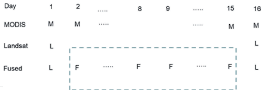
Figure 1. Fusion of Landsat and MODIS images to create a high spatial and high temporal resolution image sequence.

Many commercial cameras have incorporated the Bayer pattern [36], which is also known as color filter array (CFA) 1.0. An example of CFA 1.0 is shown in Figure 2a . There are many repetitive 2x2 blocks and, in each block, two green, one red, and one blue pixels are present. To save cost, the Mastcam onboard the Mars rover Curiosity [37–40] also adopted the Bayer pattern. Due to the popularity of CFA 1.0, Kodak researchers invented a red-green-blue-white (RGBW) pattern or CFA 2.0 [41, 42]. An example of the RGBW pattern is shown in Figure 2b . In each 4 × 4 block, eight white pixels, four green pixels, and two red and blue pixels are present. Having more white pixels is believed to help improve the sensitivity of the camera, which is important in low lighting conditions. Numerous other CFA patterns have been invented in the past few decades [43–45].