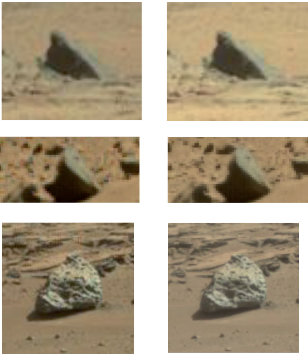
Figure 3. Comparative of demosaicing images. Left column: NASA's existing software; right column: State-of-the-art deep learning approach.

There are some new developments in demosaicing CFA 2.0 or RGBW. In [47], a new pansharpening approach was proposed to demosaic RGBW patterns. In [48], a further improved version by combining deep learning and pansharpening was proposed. In [49], a comparative study of the performance of CFA 1.0 and CFA 2.0 for low lighting images was carried out. It was found that CFA 2.0 has advantages over CFA 1.0 in low lighting conditions. It was also observed that denoising can further enhance the demosaicing performance. Finally, a new CFA 3.0 was proposed in [50] in which a comparative study among CFAs 1.0, 2.0, and 3.0 was conducted. It was observed that CFA 2.0 has better performance in terms of peak signal-to-noise ratio (PSNR) in low lighting conditions than CFAs 1.0 and 3.0. CFA 3.0 has better performance than CFA 1.0.