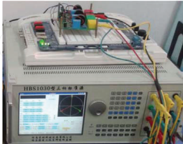
Figure 2. Measurement scheme for the laboratory experiment of the proposed method.

measurement results of the fundamental frequency are shown in Table 5 , where the “true” values for calculating the measurement absolute errors are provided by the electrical power standard HBS1030. The experimental results demonstrate that the presented algorithms have high accuracy in practice.