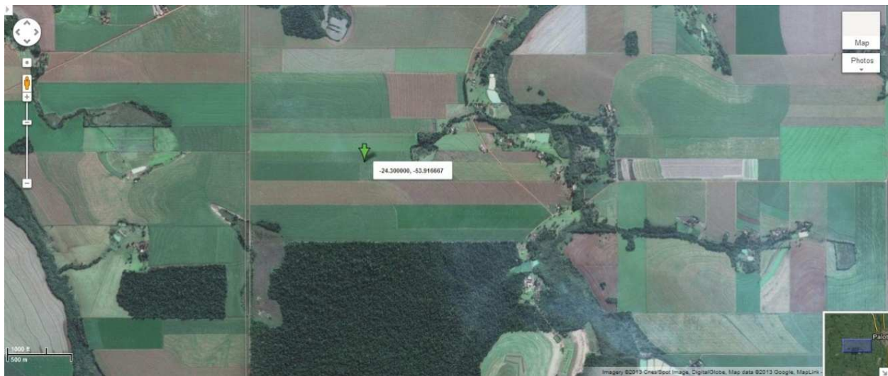
Figure 2. Local where the experiment involving fertilization with Zn in soybean and wheat culture were performed [80]

used in the work, it was observed that one of the sources presented 11039.46 \text{ mg of Pb kg}^{-1} , being the maximum limit permitted by Brazilian law (NI 27/06) [37] 10000.00 \text{ mg of Pb kg}^{-1} (Table 3). However, as previously mentioned in the section 3, the NI 27/06 tolerates the presence of contaminants up to 30% of the maximum permitted value, in this way, the fertilizer would not be considered as irregular, and can be freely traded.