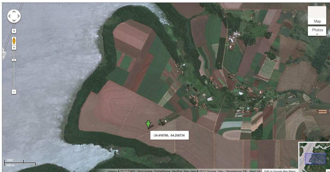
Figure 3. Local where the experiment involving fertilization with Zn in corn crop was performed [80]

used in the work, it was observed that one of the sources presented 11039.46 \text{ mg of Pb kg}^{-1} , being the maximum limit permitted by Brazilian law (NI 27/06) [37] 10000.00 \text{ mg of Pb kg}^{-1} (Table 3). However, as previously mentioned in the section 3, the NI 27/06 tolerates the presence of contaminants up to 30% of the maximum permitted value, in this way, the fertilizer would not be considered as irregular, and can be freely traded.