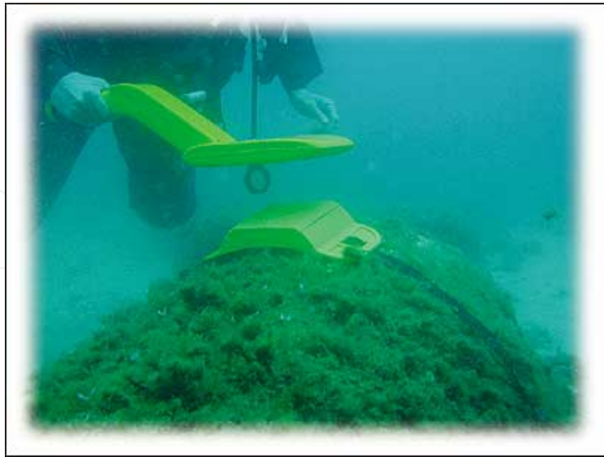
Figure 2. The Enertag system for the pipeline monitoring