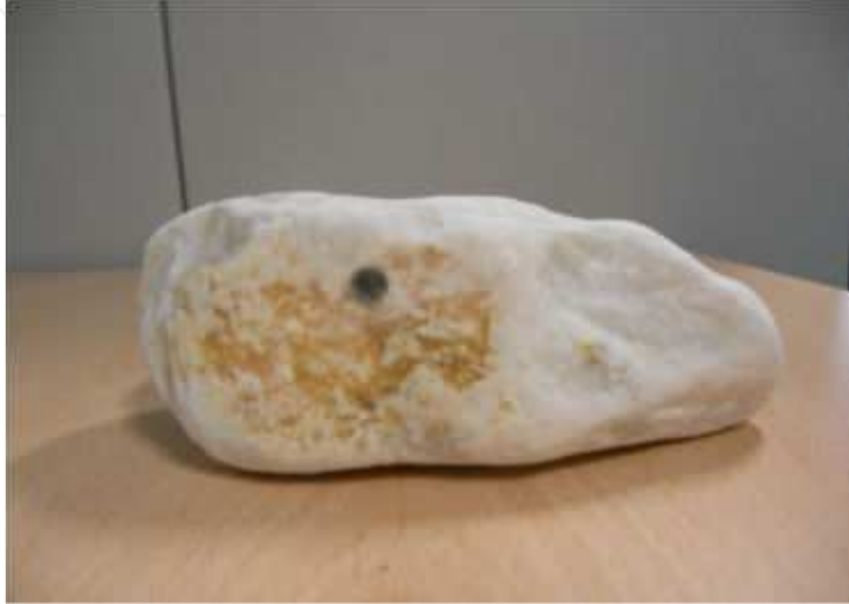
Figure 3. A Smart Pebble. On its surface is possible to notice the hole housing the transponder

The first experimentations on the Smart Pebble system were carried out in 2009 and this solution has been since then employed in several on-site applications on different beaches in Italy. The effective use of the system has roughly confirmed the results recorded in the laboratory tests: during the localization process, the transponders embedded inside the pebbles were localized even from distances higher than 50cm.