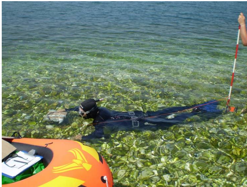
Figure 4. A moment of the localization operations