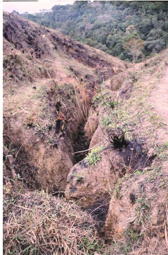
Figure 5. Piping and gully erosion in colluvium resulting from high rainfalls and vegetation disturbance in multiconvex hilly terrain in south-eastern Brazil at Jacupiranga.

sulted in extensive destruction of the original forest cover [57]. Hillslope development in this area is primarily controlled by chemical denudation in the highly permeable weathering mantles and, to a lesser degree, by slow mass movements, whilst surface wash is limited by the lack of a significant overland flow [60]. Nevertheless, the role of the destruction of the vegetation cover cannot be underestimated as leaching processes operate at high rates in the tropics and tend to remove nutrients from the upper soil horizon, possibly reducing the fertility of the soils.