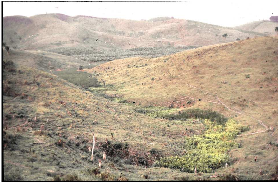
Figure 2. Shallow translational landslide and earthflow which resulted from a single rainstorm and the high moisture content in the regolith. (Photo Römer).