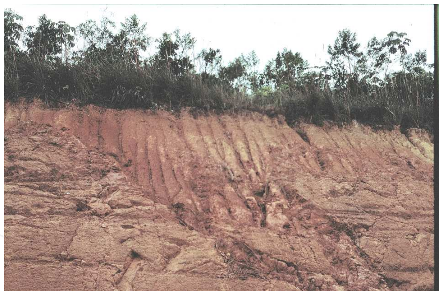
Figure 4. Accumulation of colluvium in a hillslope hollow in the drainage basin of the Jacupiranga River, which is a tributary of the Ribeira River. The colluvium has been deposited on the saprolite of the mica schists/phyllites. The colluvium was formed in the Pleistocene as a result of less dense vegetation cover and drier climatic conditions.

However, the amount of soil loss on the valley-side slopes appears to have varied in different geomorphic settings depending on the relative relief, the physical properties of the regolith cover and the process domains. Studies on ultramafic rocks in the Jacupiranga Alkaline Complex, which is part of the Ribeira drainage basin provided no evidence of an increase in soil erosion even on steep hillslopes although, mining and cultivation of tea and bananas re-