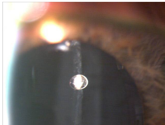
Fig. 2. Intraocular ointment drop in the anterior chamber

Even though TASS is defined as an acute inflammation, it is not rare to find TASS delayed days after surgery. It is usually caused by intraocular lenses (chemicals used in packaging, polishing, cleaning or sterilization of the lens) or even ocular ointments (Figure 2). An outbreak was reported by Werner when ocular ointment containing petroleum was associated to tight ocular postoperative patching (Werner et al., 2006).