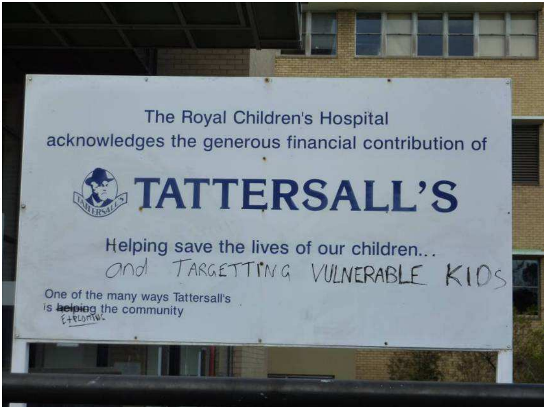
Graffiti on the sign week 2