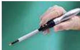
Fig. 5. Harmonic/ultrasonic scalpel.