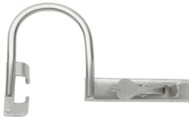
Fig. 2. Open-sided mouth gag (Davis Mouth Gag).

For a successful surgery, adequate exposure, of the oro-pharynx must be achieved. Also knowledge of the relevant anatomy and tissue tension is important. With the aid of a mouth gag, e.g, Boyle -Davis (Figure 2), the oropharynx is exposed. Dentition may be protected by a plastic or rubber athletic mouth guard and careful mouth gag placement. Care is taken not to allow the lateral flanges of the tongue blade of the gag to scratch dental enamel. Protection of the mucosa from electrical and thermal conductivity is achieved by interposing a gloved finger between the instrument metal and the patient. 13