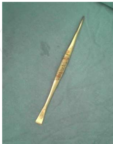
Fig. 4. Tonsil Dissector.

A frequently used method for total tonsillectomy is the “cold” or sharp dissection technique. In this technique, the tonsil and capsule are dissected from surrounding tissue using scissors, knife, or tonsil dissector (Figure 4) and the inferior pole is amputated with a tonsil snare.