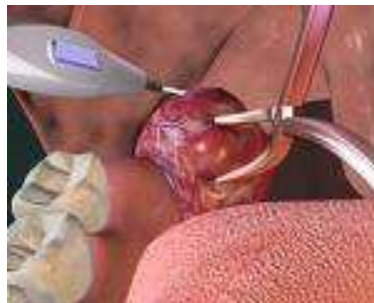
Fig. 3. Medial Traction on the Tonsil.

The tonsils are then removed using 1 of the techniques described later.