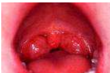
Fig. 1. Orophaynx with Palatine Tonsils.

The tonsils are well vascularized with the majority of the blood supply arising from the tonsillar branch of the facial artery. 1 The nerve supply of the tonsils arise from the ninth cranial nerve and descending branches from the lesser palatine nerves and the tympanic branch of CN IX is thought to account for the referred ear pain found in some cases of tonsillitis. The tonsils have no afferent lymphatic vessels. Their efferent lymph drainage is through the upper cervical nodes, especially to the jugulodigastric group. Tonsils and adenoids are immunologically most active between the ages of 4 and 10 years, and tend to involutes after puberty. 2