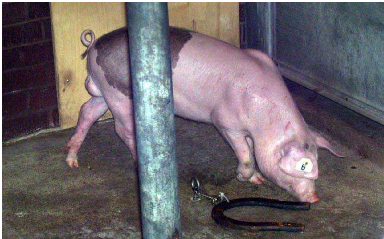
Fig. 2. A pig interacting with an object during episodic-like memory test.