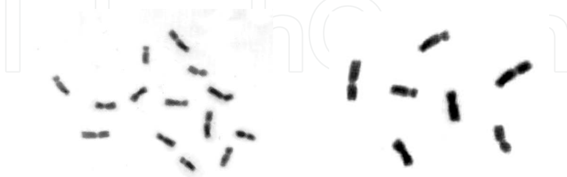
Fig. 2. Cytogenetic test for androgenetic plantlets in barley. The majority of plantlets were spontaneous doubled haploid (A) and Low percents of them were haploid (B) . Kahrizi D (2009).

Both the stage of the microspore when collected for pretreatment and the pathway of nuclear development have also been considered to influence the frequency of doubling. He concluded that microspores collected at uninucleate stages 1-3 (early, mid and late, respectively) resulted in mostly haploid and doubled haploid plants while those collected at later stages (4-6, mitosis and binucleate) resulted in mostly doubled haploids as well as some triploid and tetraploid plants. It has also been demonstrated in wheat that the pretreatment method will influence the pathway along which the nuclei will develop.