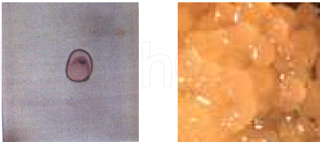
Fig. 1. Isolated microspore culture of barley. Cultured microspore after 4 days (left), Embryoid formation from cultured microspore in liquid medium (right).

The mechanism of chromosome doubling has been one of much speculation and the relationship to the influence of pretreatments is obscure, with endoreduplication and nuclear fusion as the most likely methods. A C-mitosis, such as occurs during colchicine treatment, may result in a simple restitution nucleus with a doubled chromosome number. In Datura , it was proposed that both endoreduplication and nuclear fusion were involved in chromosome doubling and that the combination of both methods could explain the ploidy levels obtained that were higher than diploid. Nuclear fusion was described as occurring when two nuclei synchronously entered into division, formed a common metaphase plate and spindle and resulted in two nuclei, each with more than one set of chromosomes. If one or both of the nuclei had undergone endoreduplication prior to nuclear fusion, triploid or higher ploidy level plants could be formed. Sunderland also showed clear evidence of endoreduplication from the generative nucleus and chromosomes from different nuclei on a common metaphase plate.