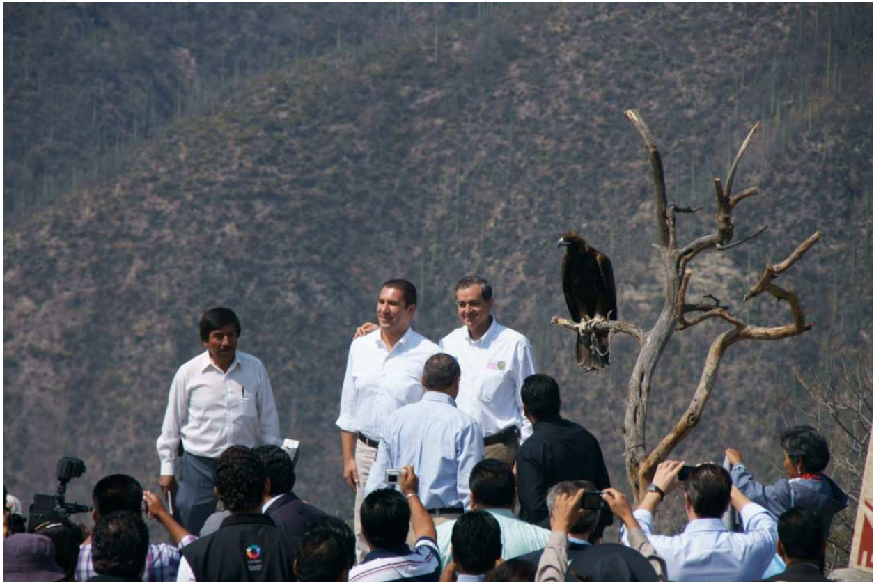
Fig. 4. Dr. Rafael Moreno Valle, Governor of Puebla State and Eng. Juan Elvira Quesada, Minister of Environment and Natural Resources Secretary, during inauguration of Natural Protected State Area "Tentzo's Sierra". At right show up the Mexican royal (golden) eagle Aquila chrysaetos canadensis.

Natural Resources Secretary, which includes nine Municipalities of the east of the region, with a surface of 145.715,8 ha., (Villarreal, 2006). On May 2, 2011, the Sustainable Environmental and Territorial Organization Secretary, of the Puebla State Government, had decreed the Natural Protected State Area "Tentzo's Sierra", which includes inside the Mixteca Poblana two north Municipalities with 15.947 ha. from the conservation and sustainable managing in to the region(Fig. 4).