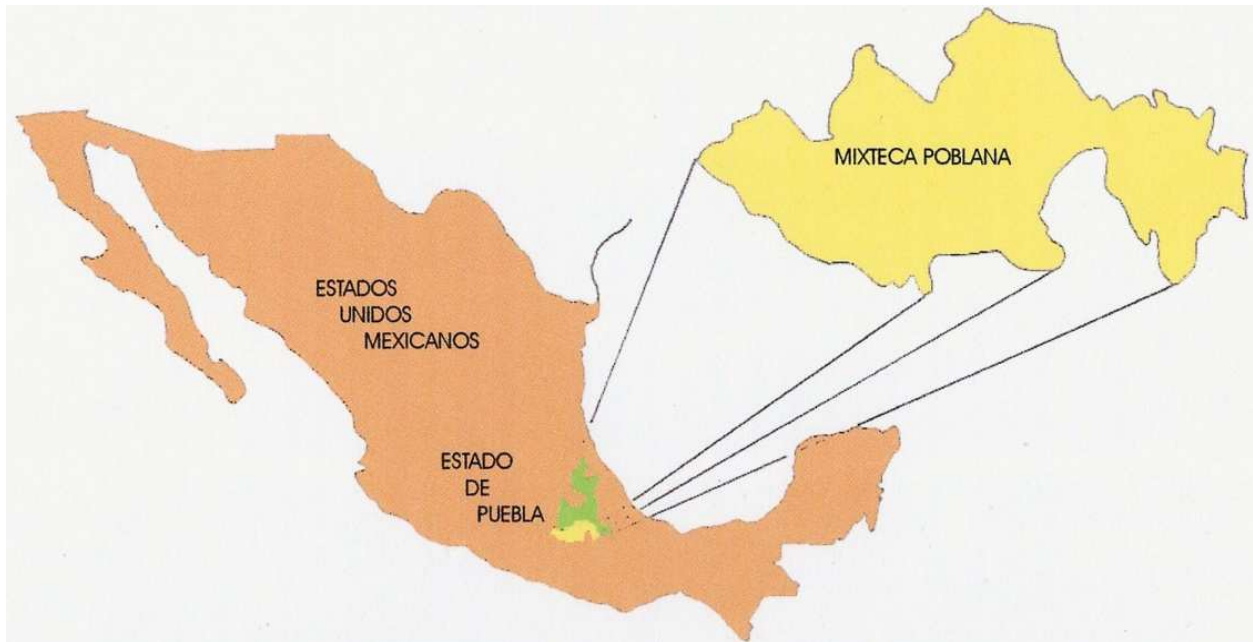
Fig. 1. Map from location of Mixteca region, Puebla State, Mexico.

population migrates principally to the New York, California and Texas states in the American Union. In the region the white tailed deer of the " mexicanus " subspecies, is distributed in 37 Municipalities by a surface of 547.550 ha. (Villarreal & Guevara, 2002).