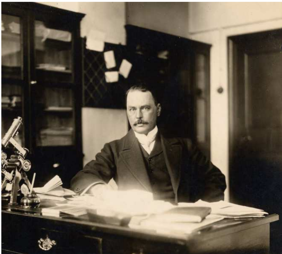
Fig. 2. Sir Ronald Ross (1857 - 1932), in 1904 at the Liverpool School of Tropical Medicine.