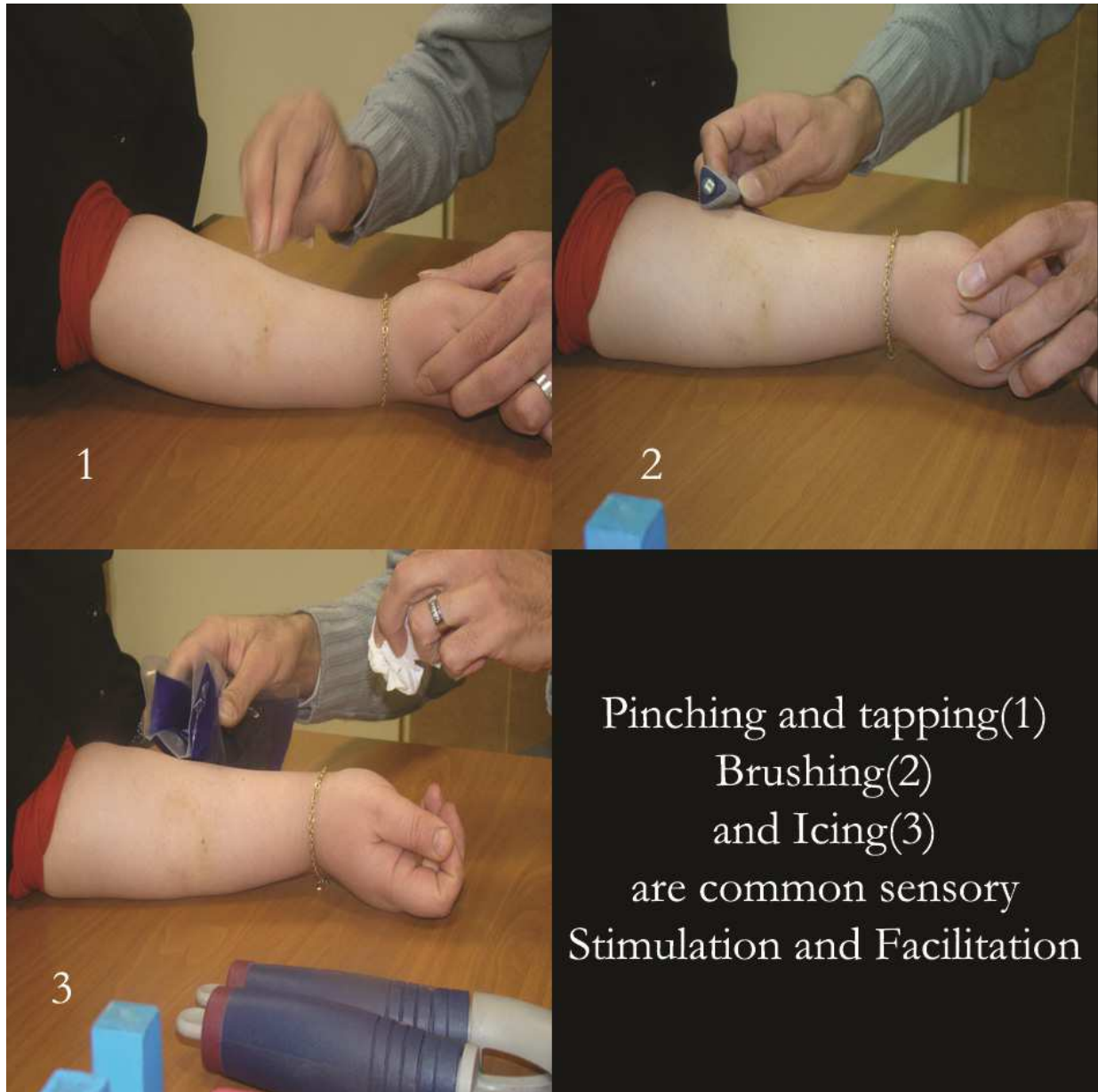
Fig. 1. Sensory stimulation and facilitation by Reza S Roghani, Rehabilitation University, Tehran, Iran

or an art, it is usually necessary to become familiar with some proprioceptive tasks specific to that activity.