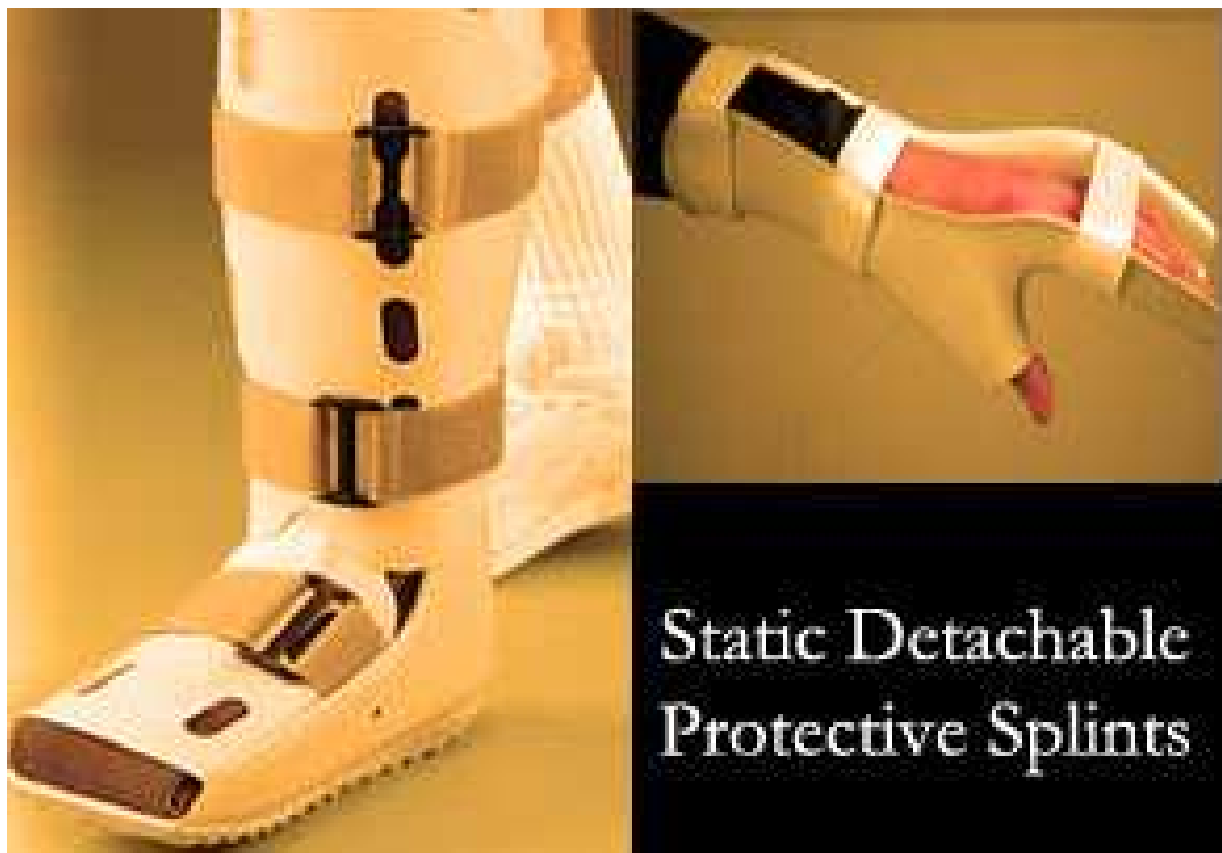
Fig. 2. Static and detachable splints by Reza S Roghani, Rehabilitation University, Tehran, Iran

Static and detachable splints [fig2] is useful mechanical devices to give rest to the paralyzed muscles and joints, preventing overstretching and shortening and to allow exercises and other therapeutic methods to be given regularly for preventing complications of continued immobilization.[16]