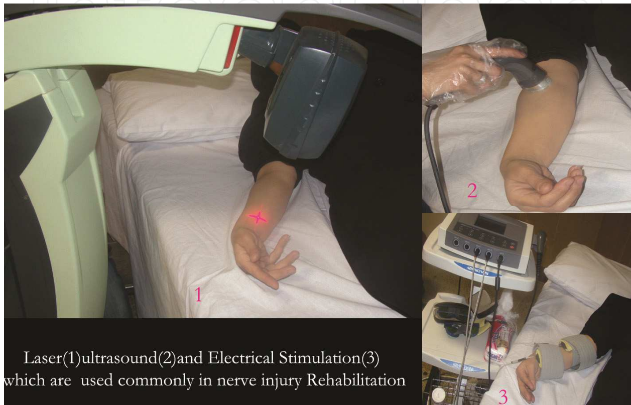
Fig. 4. Common modalities in nerve injury rehabilitation by Reza S Roghani, Rehabilitation University, Tehran, Iran

The insensitive joints and ligaments and other surrounding tissues which are affected by the injury to all or some supplying nerves are at the risk of stiffness, shortening and finally contracture. Regular daily massage, passive motion in full range at least one time per day and protective detachable static splints could prevent these complications. In case of joint stiffness dynamic splints and physical modalities such as ultrasound and laser [Fig4] will help to regain the softening and range of motion. [19]