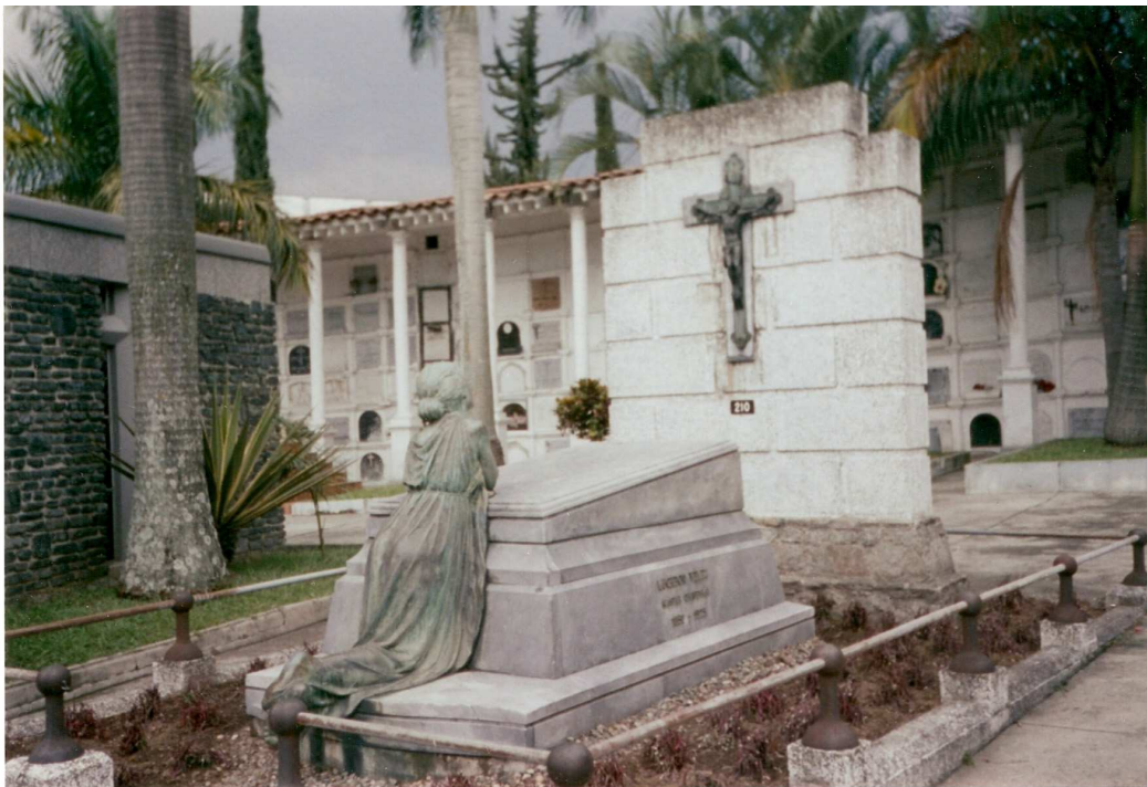
Picture 1. Dialogue. Cemetery of San Pedro, Medellín - Colombia, 1999

“The social sciences do not deal with death ever. Are satisfied with recognizing the man as the animal of the tool (homo-faber), brain (Homo sapiens) and language (homo-loquax). And yet, the human species is the only one for which death is present throughout his life, the one that accompanies the death of a funeral ritual, the only one who believes in the survival or in the resurrection of the dead”. (Morin, 1974)