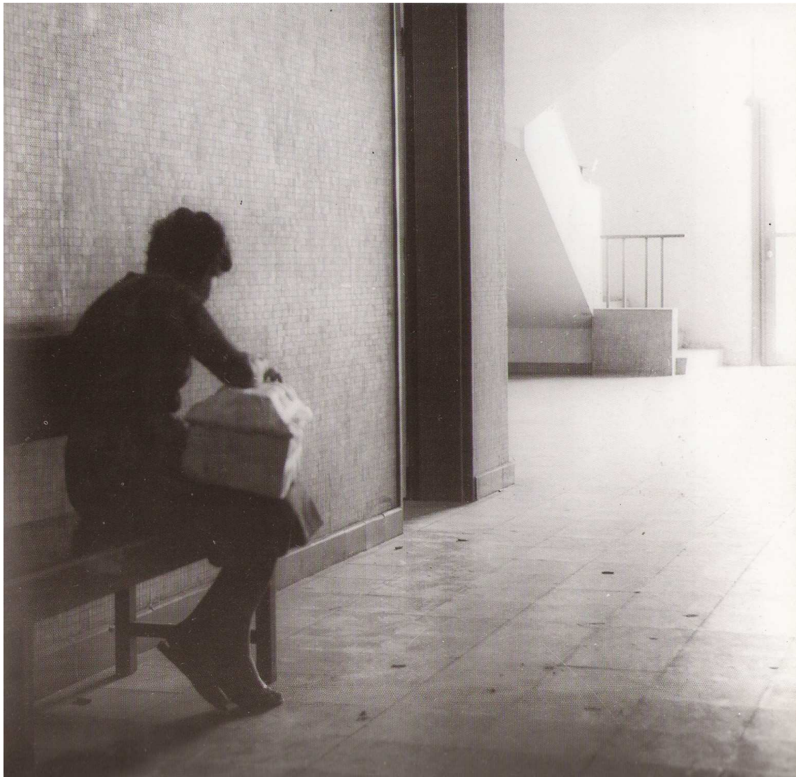
Picture 2. "Waiting" s.f. Original Copy on paper