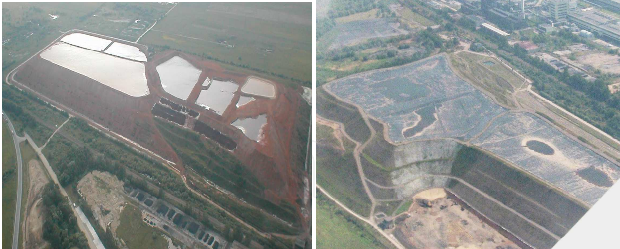
Fig. 2. Bauxite residue (brown and red mud) dump in aluminium work in Slovakia before (left, 2006) and after (right, 2011) revitalization.

predominantly in the form of quartz, sodalite, gypsum, calcite, gibbsite, rutile, represent other minority components. In Tab. 1. chemical composition of waste mud from several world aluminium oxide producers is shown. All the data, except for Slovakia, is related to waste mud originated by the Bayer process (red mud).