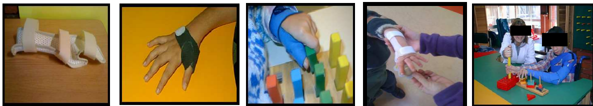
Fig. 1. From left to right: Resting splint, Soft thumb abduction, soft orthotics to stabilize the thumb and the wrist, thumb abductor long version, derotating band with shoulder strap.

In some cases, long orthotics as long resting hand orthotic (figure 1) for use during the night and sometimes during the day is the best option, in order to position and stretch the muscles in children with increased muscle tone. To position the thumb a soft or rigid abductor splint made of thin material (figure 1) is a good option. In case also need to align wrist, a semi-rigid cock-up or a long abductor of thin material (figure 1 and 1) is a good option. It can facilitate the direction of the movement the use of a derotation bandage for therapeutic purposes (Fig. 1).