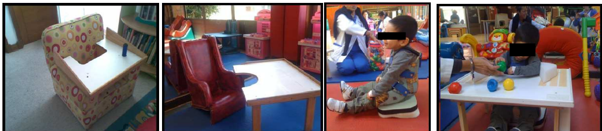
Fig. 2. Table with cutout and lateral borders; table with cutout and chair with inclination, molded sitting, sitting and dining table with cutout molding and rear bumpers forearm

As for adapted gait (figure 5), it is important the alignment and containment of the pelvis as well as the back support to prevent extensor discharges and forearm support with or without stem to facilitate the alignment of upper body.