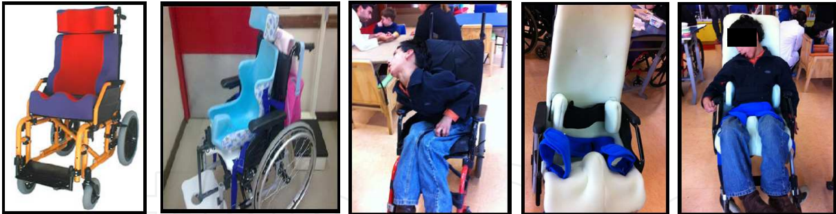
Fig. 4. Wheelchair with adapted set of cushions; wheelchair with molded sitting, wheelchair without molded sitting, molded sitting, wheelchair with molded sitting