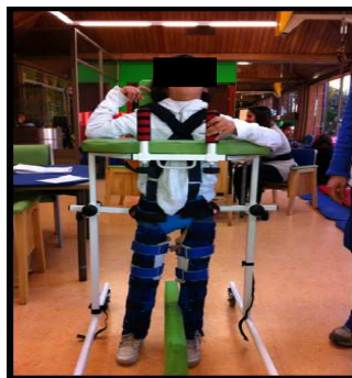
Fig. 5. Walking gait with forearm support and adaptations