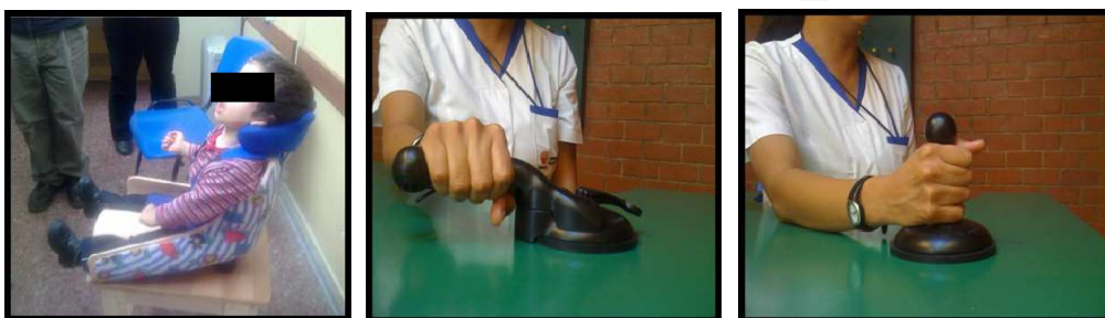
Fig. 3. Molded sitting with leg extension; Stems in prone and neutral