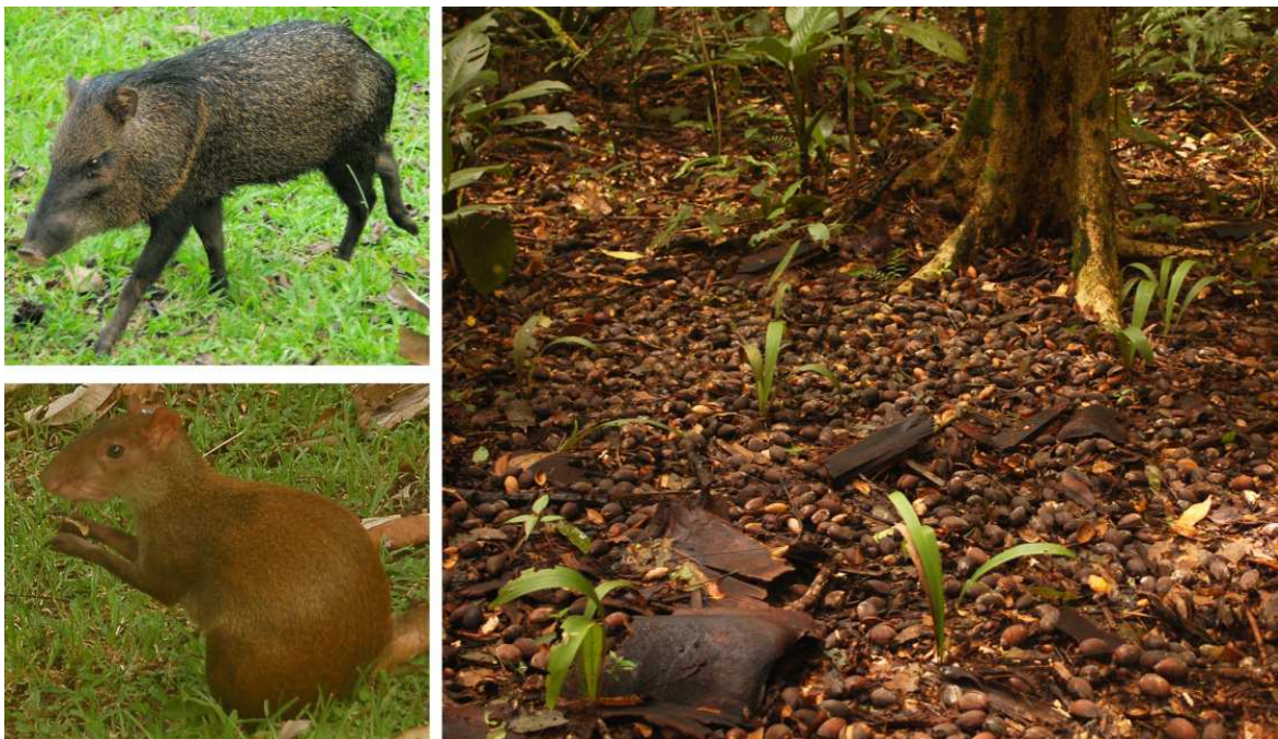
Fig. 2. Collared peccary ( Pecari tajacu ; top left), Central American Agouti ( Dasyprocta punctata ; bottom left), and a carpet of undispersed Attalea butyraceae fruits at a heavily hunted site in Parque Nacional Camino de Cruces, Panama.