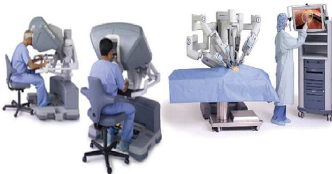
Fig. 1. Master controllers and the patient side manipulators of the new Da Vinci Si surgical system.

Once the system was on the market, Intuitive continued perfecting it, and the second generation – the da Vinci S – was released in 2006 (Figure 1). The latest version, the da Vinci Si became available in April 2009 with improved full HD camera system, advanced ergonomic features, and most importantly, the possibility to use two consoles for assisted surgery.