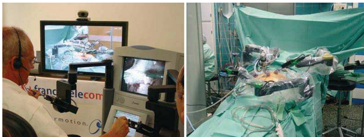
Fig. 2. The Zeus robot during the first intercontinental surgery, the colecystectomy was performed on the patient in Strasbourg from New York.

The Zeus robot proved to be a solid platform to test and experiment different telesurgical scenarios. Between 1994 and 2003 the French Institut de Recherche contre les Cancres de l'Appareil Digestif (IRCAD) (Strasbourg, France) and Computer Motion Inc. Worked together in several experiments to learn about the feasibility of long distance telesurgery and effects of latency, signal quality degradation (Fig. 2).