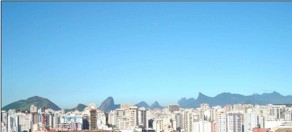
Fig. 1. A beautiful view from the top of Rio de Janeiro skyscrapers: how beautiful are the socio-environmental health and the sustainability down there?

the recommended pressure in the tires. In addition to these actions, the driver shall drive sparingly in speed, without abrupt maneuvers, and avoid unnecessary braking, which increase fuel consumption. To complete, scientists encourage attitudes of courtesy and partnership between citizens, and the use of a single vehicle by several known people to travel with the same goal and to the same places.