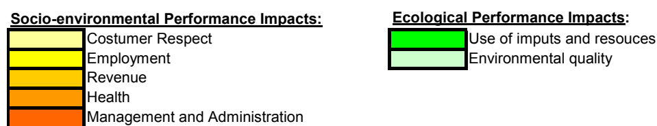
Fig. 6. Socio-environmental health quality and landscape ecology: indicators set for the eco-certification of agribusiness activities evaluation system. Data based on Santos (2006).

The base system of eco-certification of rural activities, used in this study, was described by Rodrigues et al. (2006) and presented a final worksheet with the results of each aspect studied, after the evaluation of the coefficients of variation for the components of social and environmental impact indicators and the calculation of their weighting in indexes arrays. All indicators were described and the results presented in graphics originating in their spreadsheets with the weighting tables, some of which are entered in this in the book. The results concerning the impact indices for each aspect were automatically expressed graphically in the performance of the activity sheet. Was assessed a set of twenty-four environmental performance indicators, pectinicultura activity in the IVF Lab and Larvicultura of Scallops, which encompassed a total of 125 components, with verified variables according to their respective weightings amendment, on the dimensions of the ecological and environmental performance, bringing together the 24 arrays of weighting of indicators discussed.