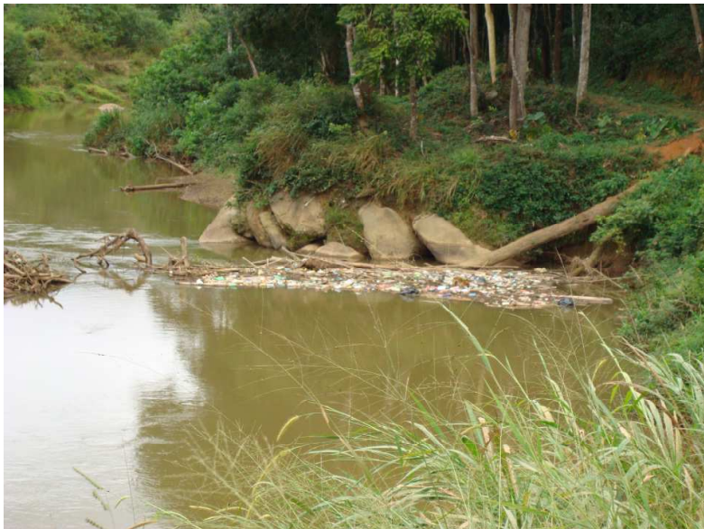
Fig. 2. Population depends on the preservation of the Atlantic forest biome remnants and disposable plastic bottles should not be destined for the rivers!

energy recovery from waste discarded by the productive sector. The law also provides for the replacement of garbage dumps by landfill for waste, the creation of municipal plans, state and federal for waste management and encouraging cooperative funding lines, which should assist the selective collection and reverse logistics. The regulation requires that the procedure of urban collection at least separate recyclables and humid.