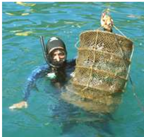
Fig. 4. Students visiting mollusks cultivation in hatcheries at the marine farms.

information about the economical situation, social and environmental area and promoting the necessary interventions, both through technical assistance and policy decisions inherent promotion of development, based on sustainable management of technological innovation.