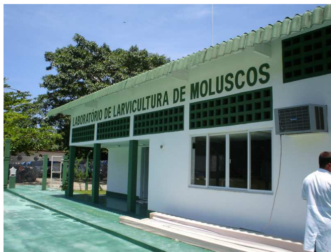
Fig. 5. The Larviculture and Oceanographic Research Laboratory from IEDBIG allow the reproduction control of fish spat, spawn and fry and research to increase aquaculture productivity in the region.

An impact assessment system organized toward eco-certification of agribusiness activities was presented in 2006 and applied with excellent results to the environmental assessment practice of the aquaculture activities in Rio de Janeiro State (Santos, 2006, Santos & Zaganelli, 2007). This paper presents the practical impact assessment method for the adoption of technology innovations in the Pectens In vitro Fertilization Laboratory (FIV-Lab) from the Institute for Eco-Development of the Ilha Grande Bay (IEDBIG), at the Jacuacanga district, Angra dos Reis, Rio de Janeiro State, Brazil (Figure 5).