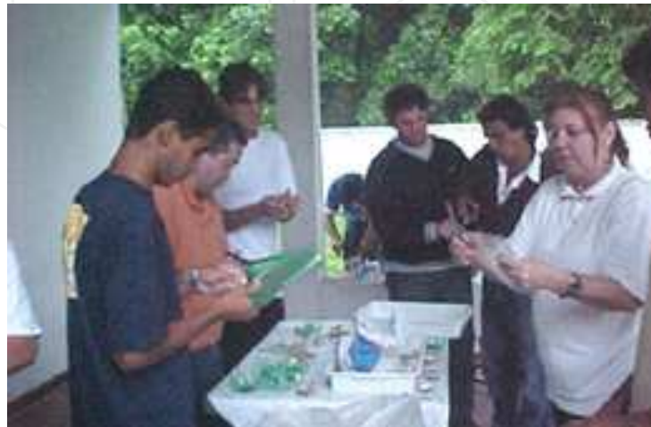
Fig. 8. More socio-environmental health quality: aquaculture, plastic lantern and handcraft products courses for the communities.

In effect, a multi-attribute EIA system for agribusiness activities' environmental management, integrating dimensions related to landscape ecology, environmental health quality, socio cultural values, economic values, and management values should be applied. It is currently under extensive field application, like this work, with contribution to the stepwise process of sustainable agricultural technology development and appraisal (Rodrigues & Viñas, 2007; Santos, 2010).