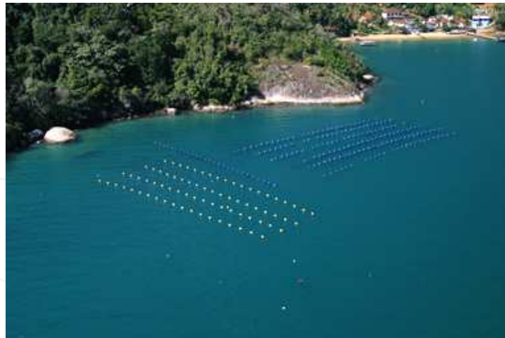
Fig. 3. Marine farms in Angra dos Reis, RJ: cultivation technologies in hatcheries.