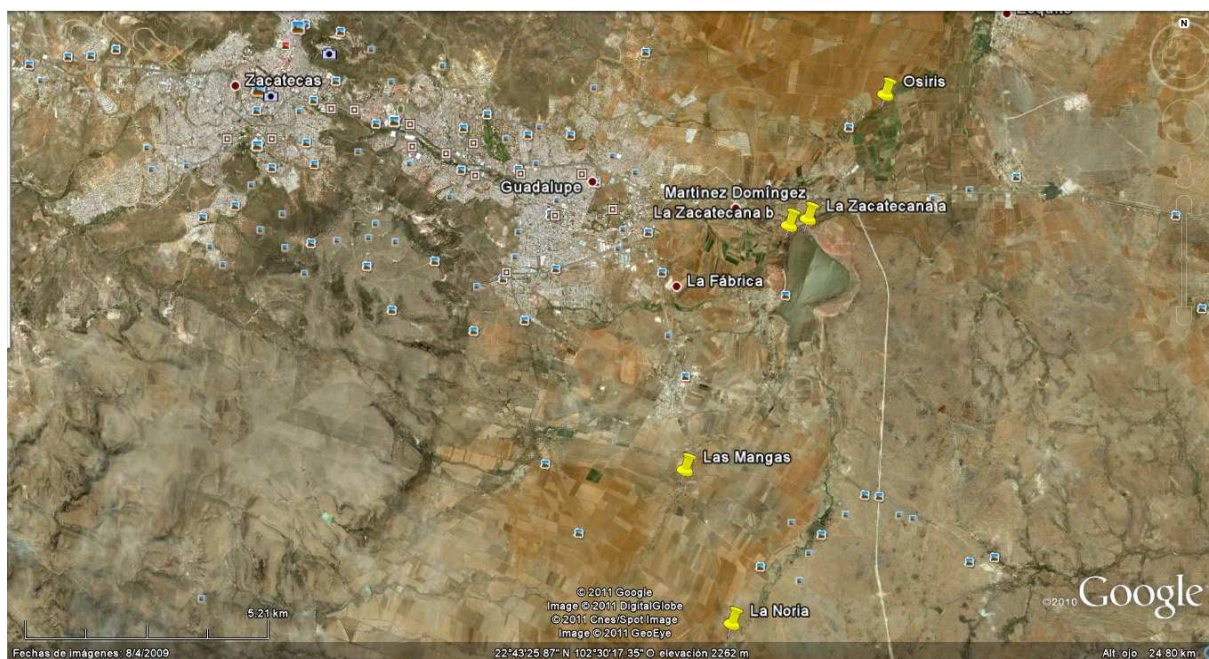
Table 1. Sampling points coordinates

Source: Mapped with Google Earth using the authors' data