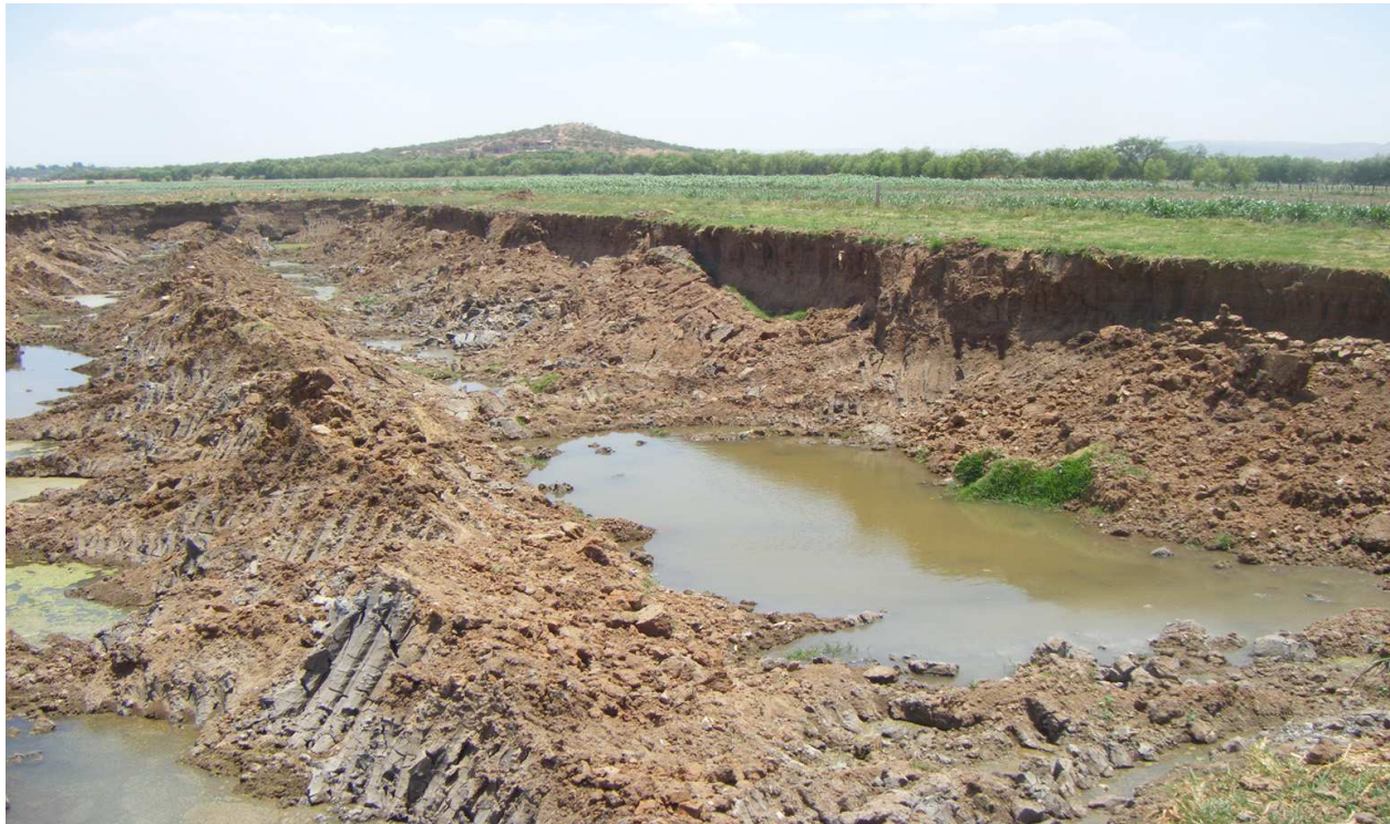
Fig. 3. Tailing pond close to agricultural land in Guadalupe, Zacatecas.