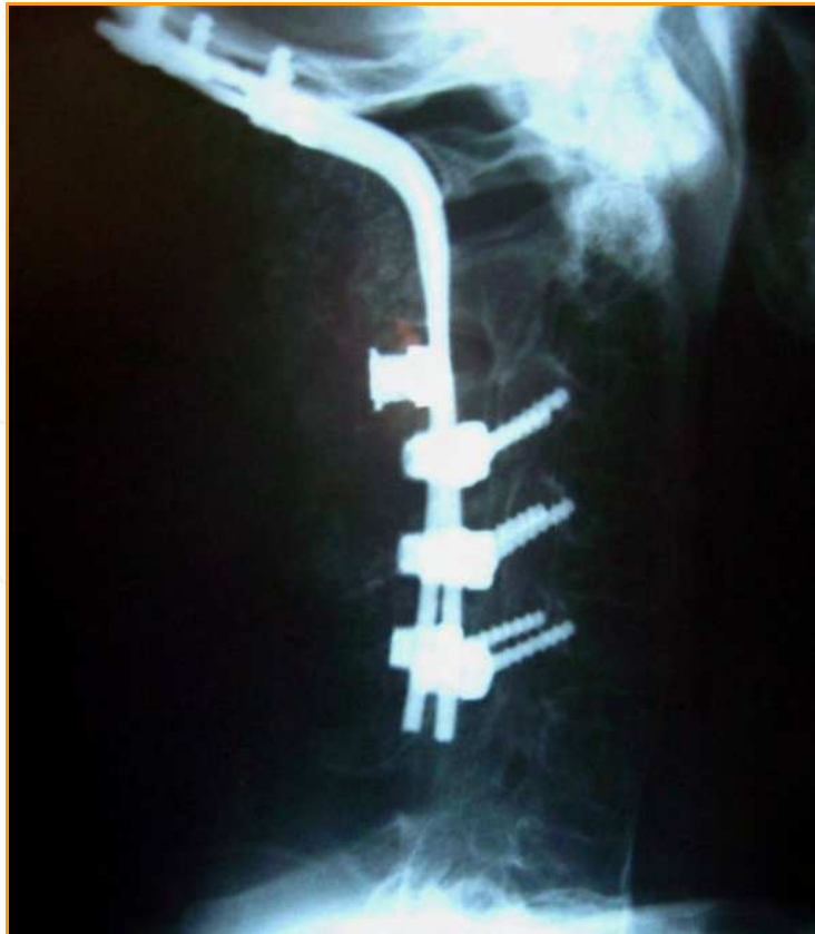
Fig. 6. The patient was treated with occipitocervical fusion by using a screw-rod stabilizing system.