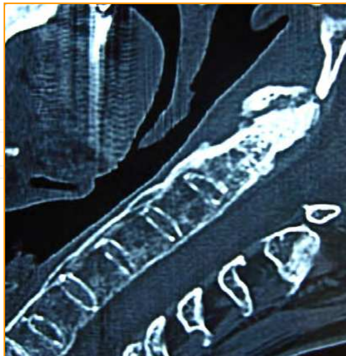
Fig. 4. CT image showing a fracture of the axis at the Cervical Spine.

Surgical treatment is more commonly used, especially in patients with neurologic compromise, obscured visual fields, pseudarthrosis, or recurrent fracture. When traction or internal fixation is used to manage these injuries, the neck should be aligned to prefracture position, not necessarily to a normal position. Minor findings in patients with AS may be associated with substantial instability in the cervical spine, secondary to the altered biomechanics of the fused spine in addition to osteopenia and the concentration of forces at the cervico-occipital and cervico-thoracic junctions. The choice of the stabilization method is depending on the patient's personality, the type of the injury and the surgeon's experience. Currently, surgical stabilization with a rigid fixation is the choice of treatment that many surgeons perform (Figures 4, 5, 6).