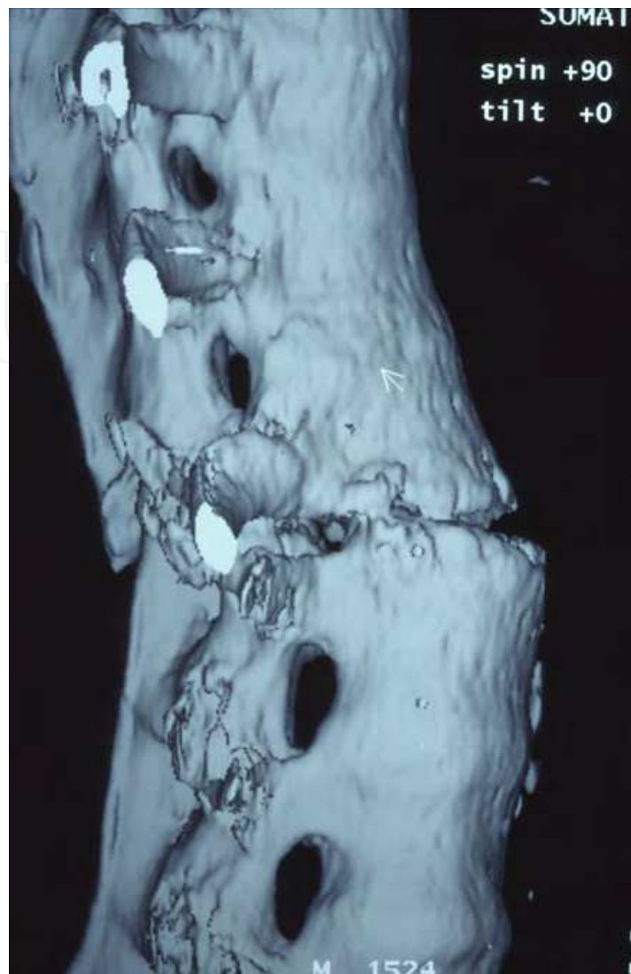
Fig. 3. Lateral 3D reconstruction image of the same case.

Preoperative evaluation of the cervical spine is essential when manipulating the neck during intubation and patient positioning. Physicians also must be aware that, because the atlanto-occipital joint is last to fuse, atlantoaxial instability may occur. Instability is usually demonstrated on lateral flexion-extension views of the neck, where the atlantodens and posterior atlantodens intervals are measured. An atlantodens interval >3.5 mm is indicative of instability. A difference of 7 mm indicates disruption of the alar ligaments, and a difference >9 to 10 mm or a posterior atlantodens interval >14 mm is associated with an increased risk of neurologic injury and usually requires surgical intervention (Kubiak et al, 2005). However, there are no guidelines for the management of atlantoaxial subluxation in patients with AS. Such management is similar to that performed in patients with rheumatoid arthritis (Ramos-Remus et al., 2006).