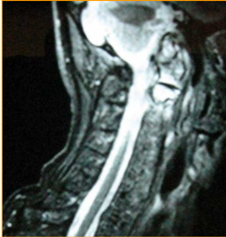
Fig. 5. MRI of the same patient with a fracture of the axis.