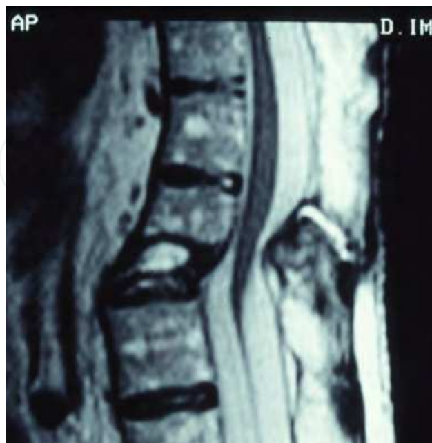
Fig. 2. Lateral MRI of the same case with a Chance type of fracture at T12-L1 level.