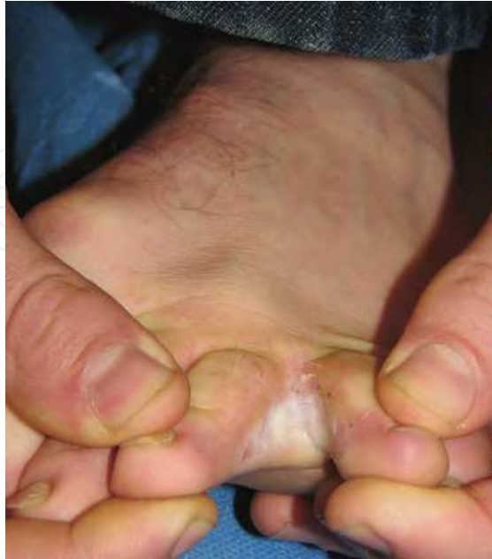
Fig. 5. Athlete's foot. Interdigital subtype of tinea pedis with erythema and scaling between digits (Tlougan et al. , 2010a).

showers or pool decks. Athletes may prophylactically apply topical antifungal agents twice weekly to prevent reinfection (Adams, 2006).