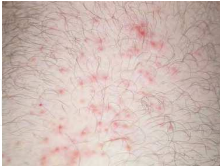
Fig. 2. Swimmer's itch. Scattered erythematous papules on thigh of a swimmer (Tlougan et al., 2010a).