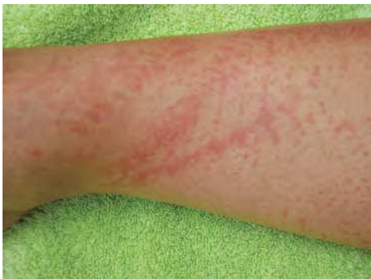
Fig. 8. Jellyfish sting. Linear erythematous plaques, which may be vesicular or urticarial (Tlougan et al. , 2010b).

Individuals stung by sea anemones present with an initial stinging or burning sensation with erythema, edema, petechial hemorrhages and ecchymoses. Eventually, an erythematous, papulovesicular eruption develops and local necrosis, ulceration and desquamation may occur (Halstead, 1988). Bathing or showering exacerbates the stinging or burning sensation. Severe side effects include acute renal failure and fulminant hepatic failure (Garcia et al. , 1994; Mizuno et al. , 2000). Seabather's eruption results from contact with larvae of the adult sea anemone and the thimble jellyfish and presents similarly with systemic symptoms occurring in up to 10% of cases. (Freudenthal & Joseph, 1993; MacSween & Williams, 1996; Sams, 1949; Tomchik et al. , 1993).