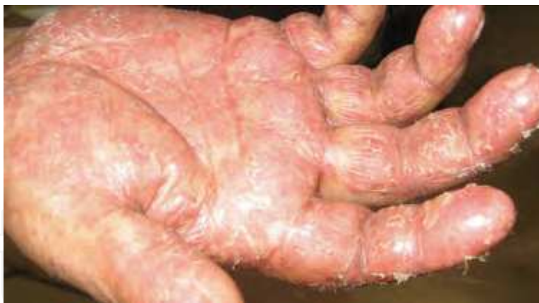
Fig. 10. Fishing rod dermatitis. Erythematous, scaly plaques on the hand (Tlougan et al. , 2010c). Reproduced with permission from International Journal of Dermatology .

Clinical presentation. Individuals present with unilateral erythematous, scaly hand plaques (Tlougan et al. , 2010c).