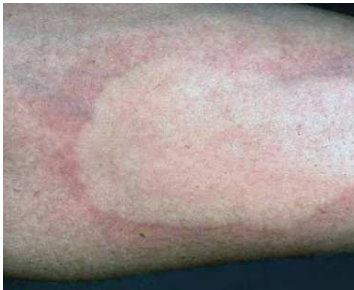
Fig. 7. Cold urticaria. Square urticarial plaque develops after placement of an ice cube on the forearm skin during rewarming of the skin (Tlougan et al. , 2010a). Reproduced with permission from International Journal of Dermatology .

Clinical presentation. Individuals with aquagenic urticaria present with urticarial wheals on any submerged skin surface shortly after contact with water. Occasionally, only a focal urticarial eruption may occur (Shelley & Rawnsley, 1964). Systemic symptoms occur rarely and include headache and respiratory distress (Baptist & Baldwin, 2005; Luong & Nguyen, 1998). Cold urticaria presents with erythematous, edematous papules along cold-exposed skin surfaces that are very pruritic. Individuals may also present with systemic symptoms including anaphylaxis and loss of consciousness which may result in drowning (Sarnaik et al. , 1986). Cold urticaria may be differentiated from aquagenic urticaria by placement of an ice cube on the forearm for several minutes, with resulting development of a square urticarial plaque during rewarming of the skin (Blanco et al. , 2000). Individuals with cholinergic urticaria typically present initially with itching or burning, with subsequent development of flushing and hives minutes after the onset of physical activity (Jorizzo, 1987). The diagnosis is supported by exercise testing, sauna test or hot bath challenge with a resulting urticarial eruption (Jorizzo, 1987).