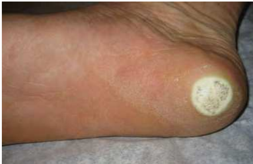
Fig. 4. Verrucae. Plantar wart with roughened surface and black specs at the center (Tlougan et al. , 2010a).

Management. Therapeutic options include mechanical destruction with liquid nitrogen, laser and curettage. Methods of chemical destruction include salicylic acid, cantharidin and trichloroacetic acid. Athletes may apply imiquimod, 5-FU, squaric acid (SADBE) and diphenylcyclopropenone (DPCP) for self-management of these lesions. (Tlougan et al. , 2010a). Recalcitrant warts may be treated with injected Candida antigen , mumps antigen or bleomycin. (Tlougan et al. , 2010a). Oral cimetidine has been shown to be effective in some studies, although its clinical utility remains debated (Orlow & Paller, 1993; Tlougan et al. , 2010a).