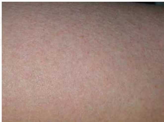
Fig. 6. Pool dermatitis. Eczematous plaques in uncovered areas in a swimmer (Tlougan et al. , 2010a).

Pool dermatitis is an irritant dermatitis to chemicals in swimming pools, particularly chlorine and bromine.