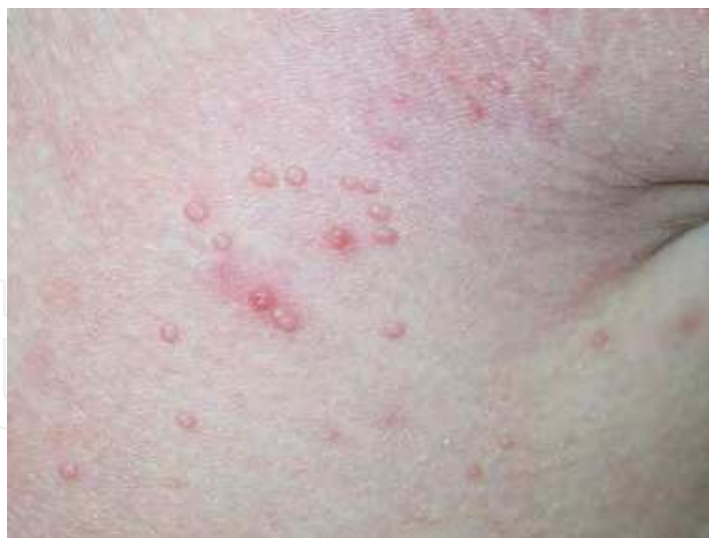
Fig. 3. Molluscum contagiosum. Several 1-2 mm pearly dome-shaped papules with central umbilication (Tlougan et al., 2010a).

Clinical presentation. Individuals present with pearly-white or skin-colored papules and nodules that may demonstrate a central dimple or umbilication (Tlougan et al., 2010a).