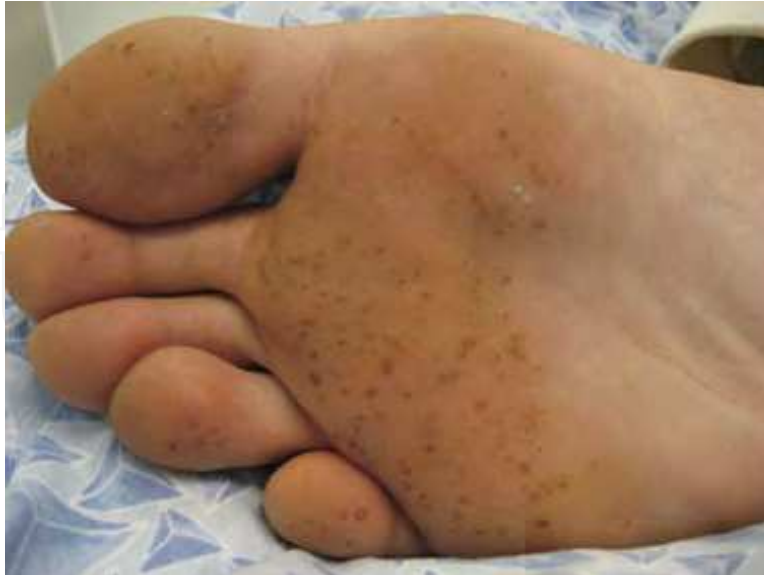
Fig. 1. Pitted keratolysis. Multiple shallow punched-out pits on anterior sole of foot (Tlougan et al. , 2010a). Reproduced with permission from International Journal of Dermatology .