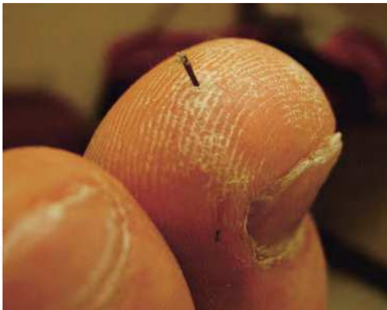
Fig. 9. Sea urchin spine. Spine punctured through the skin with resulting pain, redness and swelling (Tlougan et al. , 2010b).

Clinical presentation. Individuals in contact with the spines of seastars may present with puncture wounds and a burning sensation which may persist for one month (Auerbach, 1991). Contact with sea urchin spines may result in a painful puncture wound with surrounding erythema and edema, while broken spines may remain lodged in the skin. Rarely, tenosynovitis and systemic reactions including nausea, syncope and respiratory distress may occur (Baden, 1987). Contact with sea cucumbers may present as a burning irritant dermatitis. The sea cucumber toxin holothurin, a potent cardiac glycoside, may cause a chemical conjunctivitis and even blindness, while ingestion may result in death (Tlougan et al. , 2010b).