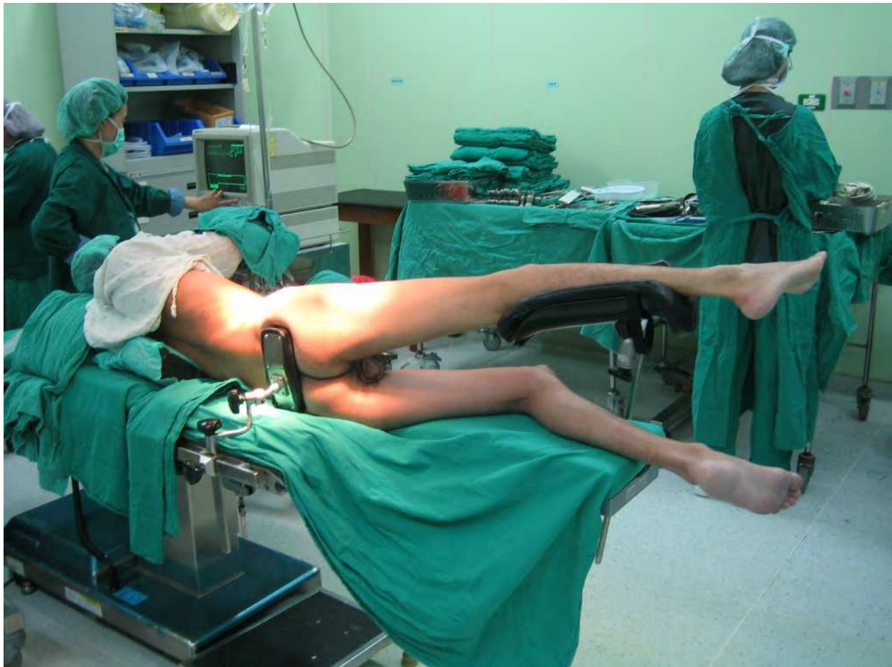
Fig. 4. The special operation table for modified Watson-Jones approach.

Matta et al. has described a unique method of THA using direct anterior approach to the hip. [22] The patient is put on a fracture table that the leg can be pulled by traction in extension and external rotation position. Fluoroscopy can be used during the procedure to control the leg length. However the technique needs a well organized surgical team to adjust the traction and fluoroscopy. Some rare complications such as the ankle fracture or calcaneal fracture have been reported.