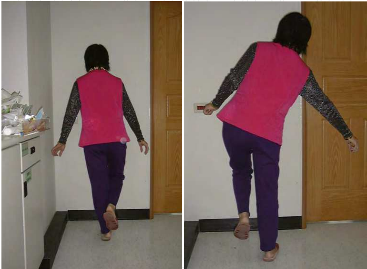
Fig. 2. The patient with abductors weakness. (A) When standing on the sound leg, the pelvis can be kept level and will not drop. (B) When standing on the affected leg, patient will compensatory list to the affected side to avoid pelvis dropping. (Duchenne sign)

and the joint capsule are then incised in a T-manner to facilitate anterior dislocation of the hip. In standard lateral approach of Hardinge [17], part of the vastus muscle can be incised to help the exposure. In modified method, the origins of the vastus muscle can be spared to decrease the tissue trauma. Possible risks of the approach involve an injury to the muscular braches of the superior gluteal nerve or direct injury to the muscle fibers by compression or retraction during surgery. This will result in damage to the gluteal muscles or muscular insufficiency and is associated with higher chance of Trendelenburg sign ( Figure 2 ) postoperatively. [18]