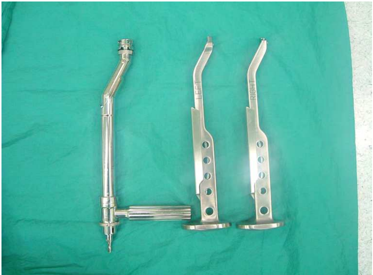
Fig. 5. Dog-legged instruments can be used to avoid skin and soft tissue impingement during MIS surgery.

and acceptable to the orthopaedic surgeons than the muscle-sparing techniques. The abridged incision techniques basically are the modification of the conventional approaches by reducing the skin incision and creating a mobile window for surgical field visualization. Special instruments are designed for the ease of surgery ( Figure 5 ) For the transgluteal approach to the hip joint, about one third to one half of the musculotendinous portion of gluteus medius and minimus are detached from the greater trochanter to facilitate anterior dislocation of the hip joint. Care should be taken not to damage the superior gluteal nerve by overstretching the muscle fibers. For the posterolateral MIS approach to the hip joint, the piriformis tendon or part of the quadratus femoris tendon can be preserved. The hip is dislocated posteriorly by internal rotation, adduction, and flexion. Emphasis has also been on the secure repair of the posterior capsule and the short external rotators after prosthesis implantation. By this modification, this approach proves to be a reliable and safe procedure and the dislocation rates are significantly decreased. [3,4]