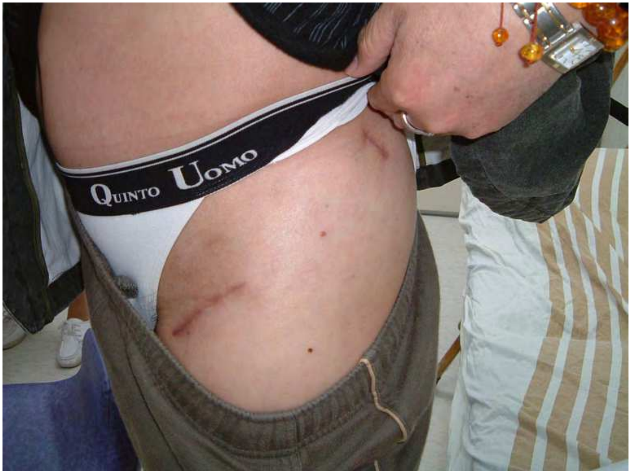
Fig. 3. Skin incision of the modified two-incision method.

We and others have modified the two-incision technique by putting the patient in the lateral decubitus position [9-11]. The anterior skin incision is made perpendicular to the long axis of the femoral neck about 3 to 4 finger-breadth distal to the ilioinguinal line. ( Figure 3 ) The hip joint is approached through the Smith-Peterson interval. Double neck cutting to the hip joint is also needed. While the anterior skin incision is made along the intertrochanteric line, the greater trochanter and the proximal femur can be visualized more easily by gentle retraction of the gluteus medius and tensor fascia lata. By this modification, the process of femoral canal preparation can be safely done under direct vision without the help of the fluoroscopic monitoring. [9-11,19]