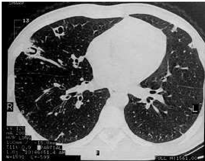
Fig. 3. Computed tomography scan showing peripheral cavitary nodules with thick irregular walls from 1 to 3 cm of size

In many instances, these radiological findings precede the clinical manifestations of IE. Also, the follow up of septic emboli could be performed by computed tomography.