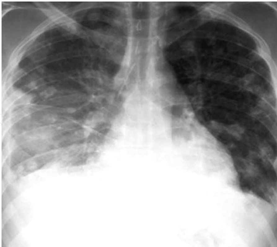
Fig. 2. Chest X-ray showing bilateral opacities. Also it can be observed the presence of pleural fluid