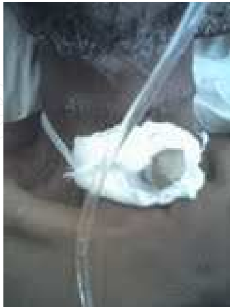
Fig. 2. Repaired cut throat injury.

Some authors are of the opinion that self-harm attempts can be grouped into 'serious suicide attempts' and more impulsive forms of deliberate self-harm. The former is typically associated with severe mental illness, high intended lethality and attempts by the suicide attempter to avoid rescue. The latter is considered a manifestation of personality disorder or acute crisis, where there are impulsive, poorly planned attempts at self harm. This rule of thumb may be misleading, regardless of the potential for death or serious injury in the deliberate self harm category, the rates of completed suicide years after a seemingly minor episode of so called 'deliberate self harm' are significant. This fact is highlighted in a study done in Australia in which 223 patients were followed from 1975 onwards. Of those who had made an attempt at deliberate self harm in the mid 1970's, 4% had completed suicide at 4 years, 4.5% at ten years and 6-7% by 18 years.