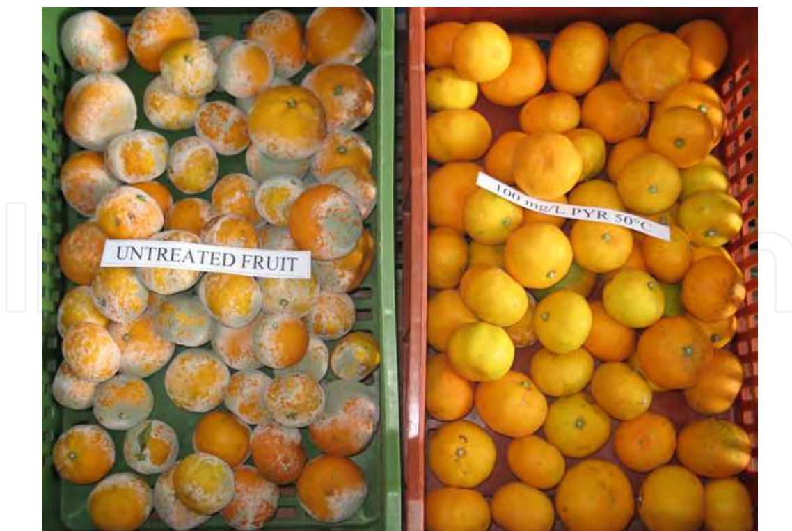
Fig. 3. Stored mandarins treatment with pyrimethanil at 100 mg ·L -1 and 50 °C against P. italicum (D'Aquino et al., 2006).