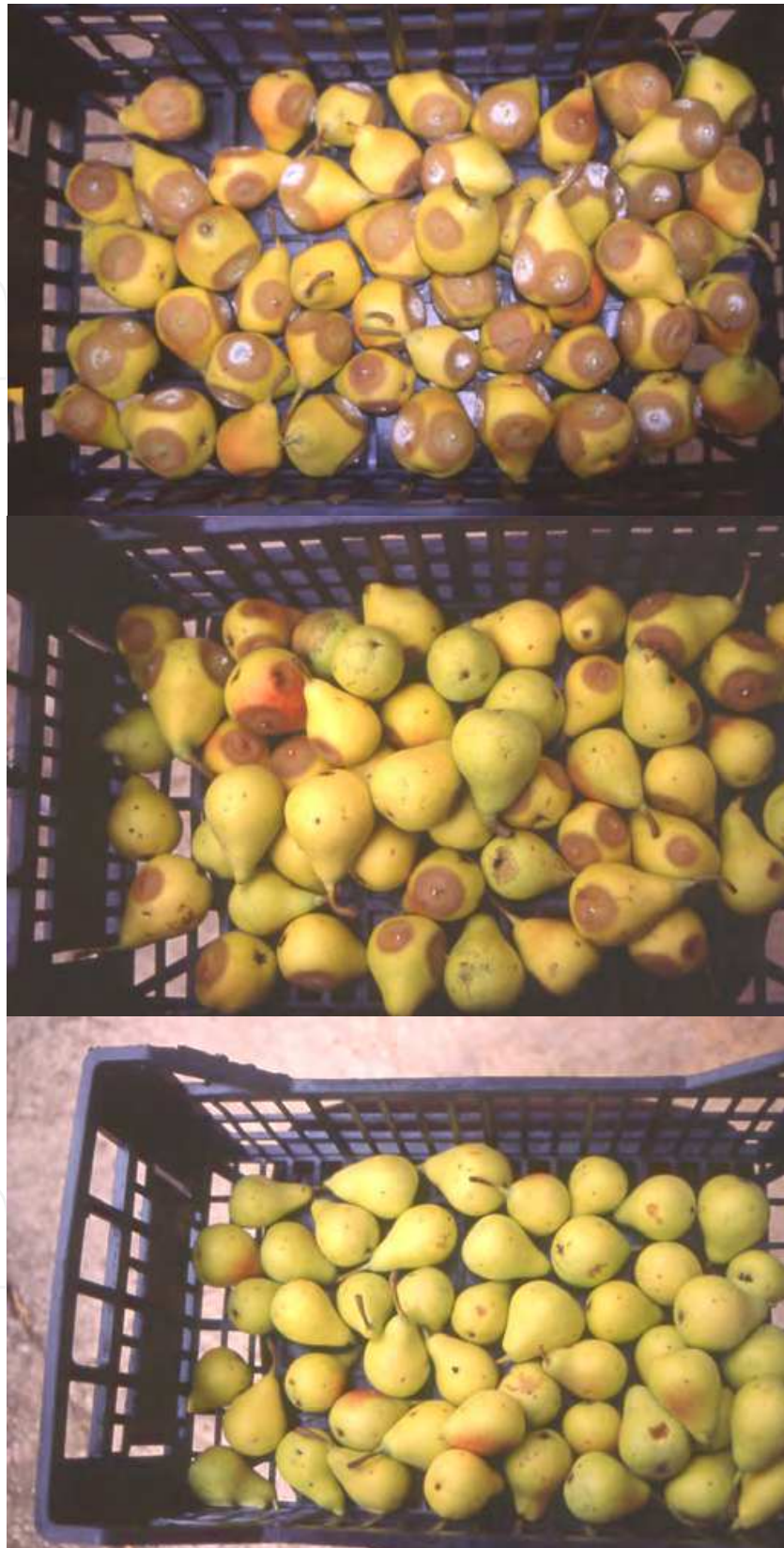
Fig. 5. Stored 'Coscia' pears after inoculation with Penicillium expansum (upper), water dip at 50 °C (middle), and treatment with fludioxonil at 100 mg L -1 and 50 °C (above) (Schirra et al., 2008b).