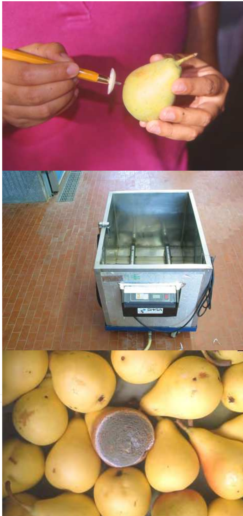
Fig. 4. Wounding of 'Coscia' pears before inoculation with Penicillium expansum (upper), apparatus for water dip at 50 °C (middle), and mould development after shelf life (above) (Schirra et al., 2008b).