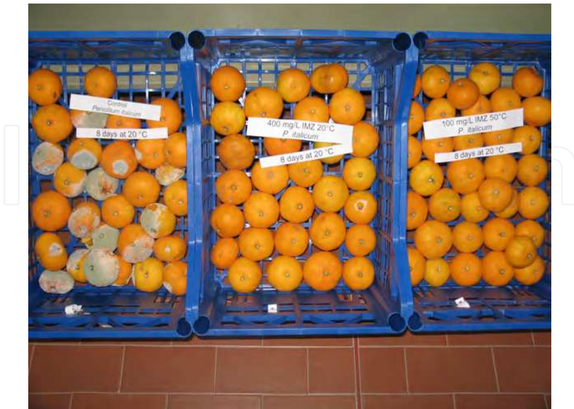
Fig. 2. Stored mandarins treated with Imazalil at 100 mg ·L -1 and 50 °C and 400 mg ·L -1 at 20 °C against P. italicum (Schirra et al., 2005b).