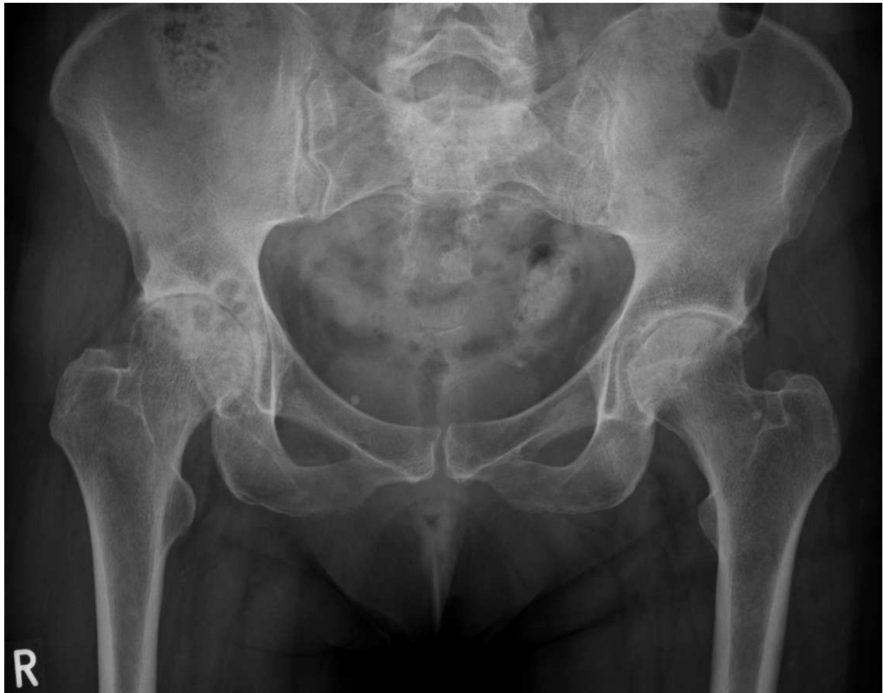
Fig. 1. Anteroposterior radiograph of the pelvis showing, right hip osteoarthritis with a triad of joint space narrowing, subchondral cysts and osteophyte formation.