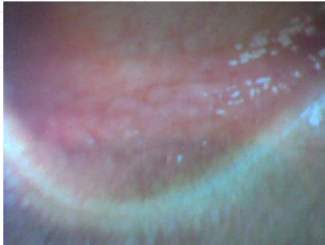
Fig. 2. Follicles at the lower fornix

Follicles consist of hyperplasia of the lymphoid tissue of the stroma. Follicular conjunctival responses appear as smooth, rounded nodules. These nodules are avascular at their apices and are surrounded by fine vessels at their bases (figure 2). They are usually most prominent in the forniceal conjunctiva. The main causes of follicular conjunctivitis include adenoviral infection, primary herpes simplex viral infection, molluscum contagiosum infection, enteroviral infection, chlamydial infection, and toxicity from certain medications.