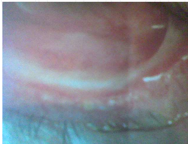
Fig. 5. Conjunctival pseudomembrane

Pseudomembranes consist of coagulated exudates which adhere loosely to the inflamed conjunctiva. They are typically not integrated with the conjunctival epithelium and can be removed by peeling, leaving the conjunctival epithelium intact (figure 5). Their removal produces little if any bleeding. Epidemic keratoconjunctivitis (EKC), liginous conjunctivitis (a rare idiopathic bilateral membranous/pseudomembranous conjunctivitis seen in children with thick, ropy, white discharge on the upper tarsal conjunctiva), allergic conjunctivitis, and bacterial infections are the primary causes.