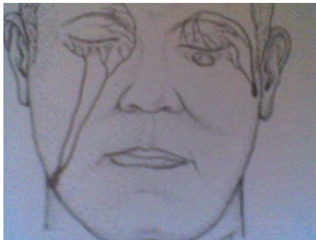
Fig. 4. Lymphatic drainage of the conjunctiva

Regional lymphadenopathy often coexists with follicular conjunctivitis representing a similar lymphoblastic proliferation.