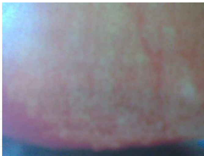
Fig. 3. Papillae reaction of the upper palpebral conjunctiva

In contrast to a follicular conjunctival response, a papillary conjunctival response is nonspecific and can be caused by many agents. It can occur in any nonspecific conjunctival inflammation, including mechanical irritation and allergic eye disease. It is usually seen on the upper tarsal conjunctiva, a papillary response is a fine mosaic pattern of dilated, telangiectatic blood vessels (figure 3). Papillae vary in size from tiny red dots to polygonal elevations. Each papilla has a central fibrovascular core that gives rise to a vessel branching outward in a spoke like pattern. The connective tissue septa surrounding the papillae are anchored in the conjunctival stroma, resulting in hyperemic areas surrounded by pale tissue