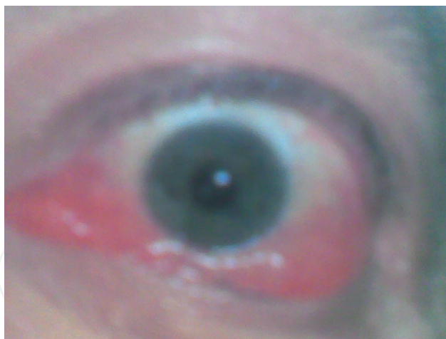
Fig. 8. Chemosis