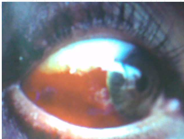
Fig. 7. Conjunctival hemorrhage

A subconjunctival hemorrhage is a bleeding underneath the conjunctiva. This varies in extent from small petechial hemorrhage to an extensive spreading under the bulbar conjunctiva; as a flat sheet of homogeneous bright red colour with well defined limits (figure 7). As the condition doesn't cause any pain or discomfort, the condition might be noticed by a colleague before the patient spots it. subconjunctival hemorrhage can look extremely ugly. However, like a bruise, it will start to fade, turning bluish, green, and yellowish before disappearing entirely. Petechial subconjunctival haemorrhages are usually associated with acute picornavirus and pneumococcal infections.