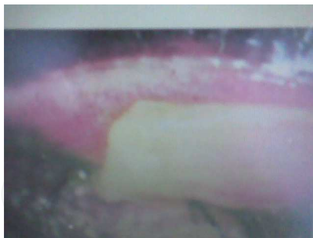
Fig. 6. Tarsal conjunctival True membrane

A true membrane forms when the fibrinous excretory or inflammatory exudate that is secreted by invading microorganisms or ocular tissues permeates the superficial layers of the conjunctival epithelium. True membranes become interdigitated with the vascularity of the conjunctival epithelium. They adhere firmly; tearing and bleeding often result when removed (figure 6). B-hemolytic streptococci, Neisseria gonorrhoeae, Corynebacterium diphtheriae, Stevens-Johnson syndrome (severe systemic vesiculobullous eruptions affecting the mucous membranes-erythema multiforme) and chemical or thermal burns are among the common etiologic sources.