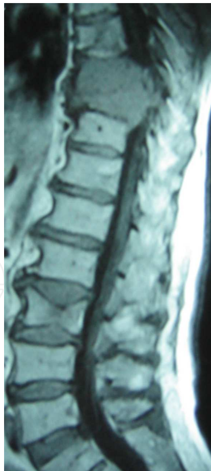
Fig. 4. Total disruption of the 9 th dorsal vertebral body due to a metastatic prostate carcinoma, with spinal cord compression.

The progression of metastatic bone disease in patients with prostate cancer can lead to debilitating skeletal-related events (SREs) (Ofofein MG, et al., 2002). About 70–80% of patients with metastatic prostate cancer present with or develop bone metastasis (Polascik TJ, 2008), and are at increased risk for skeletal-related events (SREs), which include pathological fractures, spinal cord compression (figure 4), and severe pain requiring radiotherapy or surgery for bone lesions. These SREs result in significant complications that reduce quality of life (Botteman MF, et al., 2010).