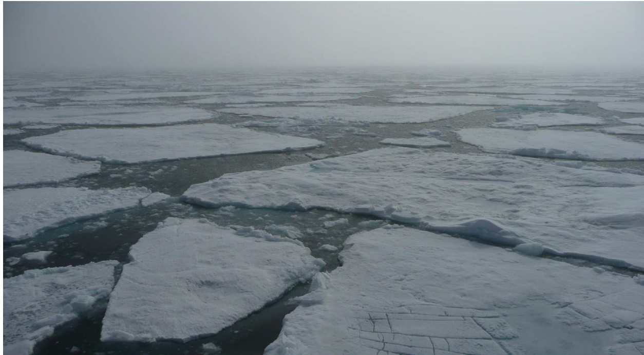
Fig. 2. Although sea ice has partially broken up on this bay, thin ice is beginning to form over the open water areas again. Such observations of episodic ice thaw are one type of observation sought in the IceWatch Canada program.

particularly for those parts of the country at higher latitudes where the population of Canada is sparse.