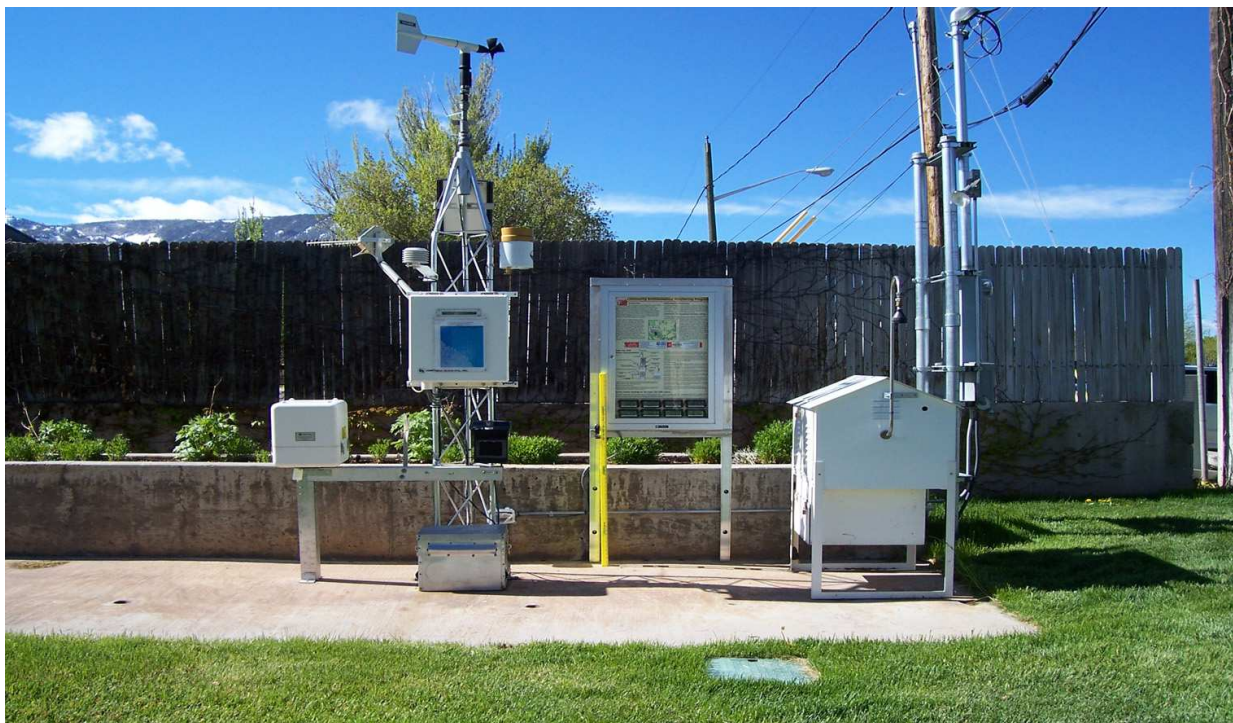
Fig. 4. A typical CEMP environmental monitoring station, with a full suite of meteorological sensors, radiation detection equipment, air sampler, and interpretive display with real-time sensor readouts.

The public participants in this program are not strictly volunteers, but receive a small monthly stipend for their duties as employees of DRI. The decision to hire them as employees was made in part to stress the importance of their sample collection duties, but also to offer them protection for any injuries that might occur during the discharge of their duties. The amount they are paid (approximately $150 US per month) is small, so as not to create the public perception that they are "in the pocket" of the DOE sponsors, and simply being given messages to parrot to their communities. On the contrary, CEMs are provided with regular training on the basics of ionizing radiation, and become knowledgeable on subjects ranging from radiation detection to local environmental conditions. Through attendance at these training workshops, the CEMs also become effective liaisons between local and federal entities, helping to identify concerns of people in their communities.