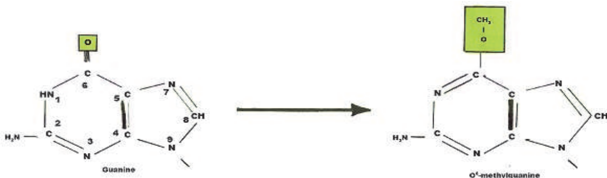
Fig. 1. Alkylation of bases

Most frequently, DNA methylation generates 7-methylguanine and 3-methyladenine. Having no effect on the coding specificity of the base, 7-methylguanine can be considered as less harmful (Zhao et al., 1999). However it can cause the blocking of DNA replication by the destabilization of the glycosyl bond. 3-methyladenine also blocks replication. DNA glycosylase is present in all living cells, removing 3-methyladenine from DNA. However, this action is found to be decreasing by age. 7-methylguanine repair is very insufficient and its accumulation can be observed in mammalian DNA (Atamna et al., 2000).