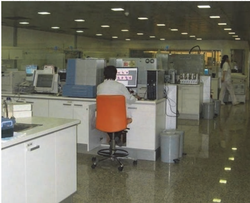
Fig. 1. There should be separate working areas in the laboratory.

have a sufficient and suitable number of rooms or areas to assure the isolation of test systems and the isolation of individual projects, involving substances or organisms known to be or suspected of being biohazardous. There should be storage rooms or areas as needed for supplies and equipment and should provide adequate protection against infestation, contamination, and/or deterioration. Facilities for handling test and reference items should be planned. To prevent contamination or mix-ups, there should be separate rooms or areas for receipt and storage of the test and reference items, and mixing of the test items with a vehicle(Figure 1).