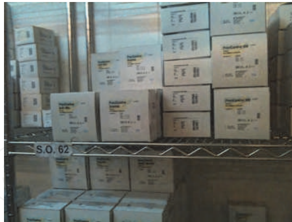
Fig. 4. Storage of the test material in an organized order.