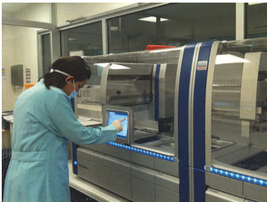
Fig. 2. Laboratory equipment should routinely be maintained and calibrated.

6.1.3 While monitoring the study laboratory staff should always have the following questions on mind: Was the equipment functioning properly? Who performed the work, what was the date, and what specific parameters did they use? Was there a problem? How was the problem fixed? Were there any problems with the reagents and solutions?