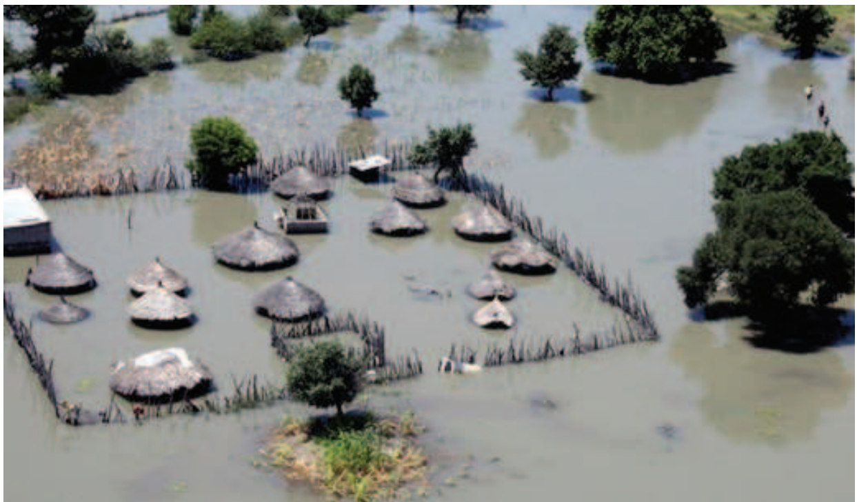
Fig. 4. Flooding in the Oshakati area in 2009, some 800 km north of Windhoek.

In Windhoek pesticides are applied for weed removal in paved areas such as airfields car parks, road pavements, and railway lines and sports facilities where grass is kempt for recreation purposes. These sources of pesticides pose serious problems, given the fact that the Windhoek aquifer is currently used as a major storage facility of fresh water.