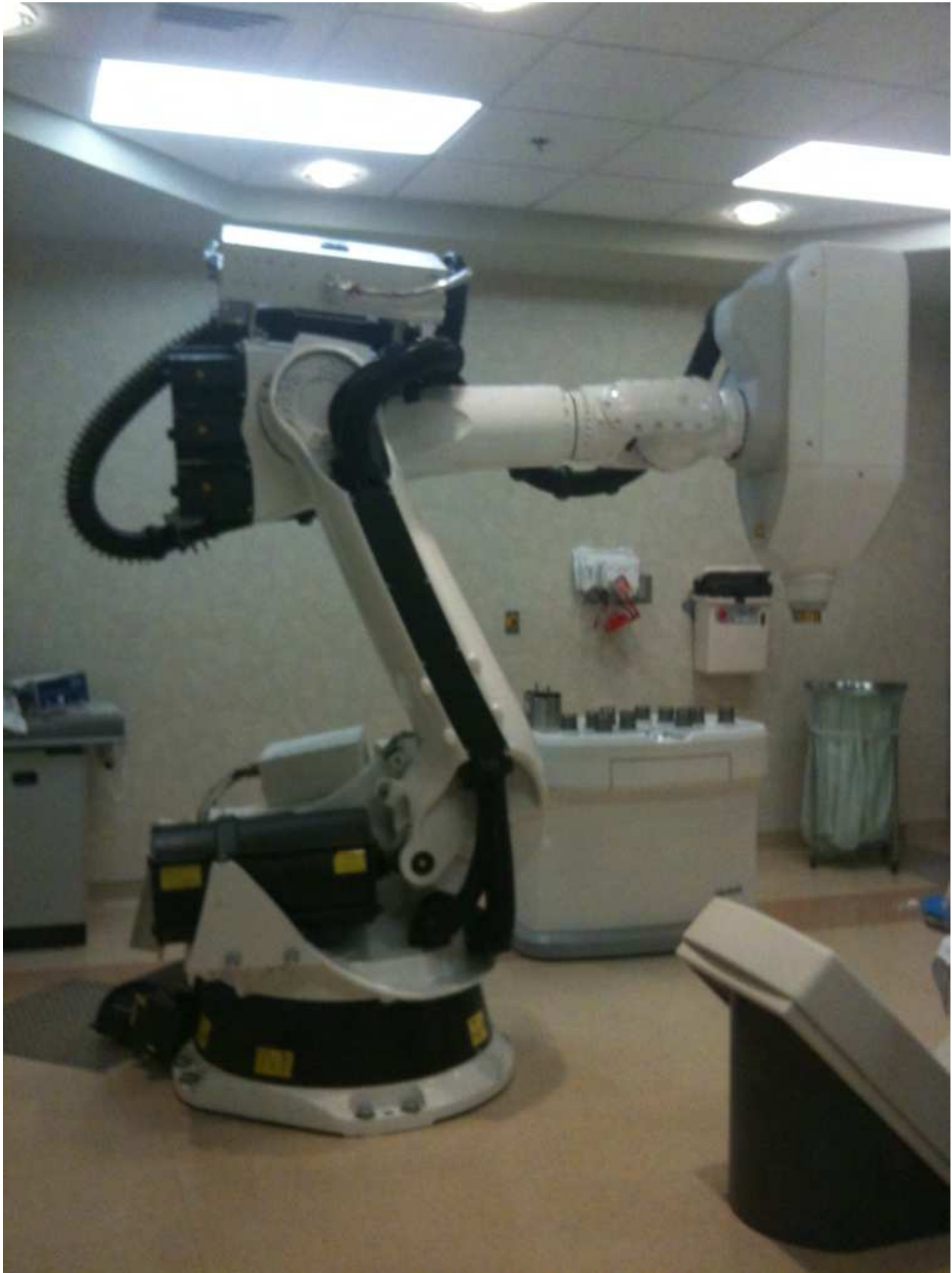
Fig. 3. CyberKnife Unit