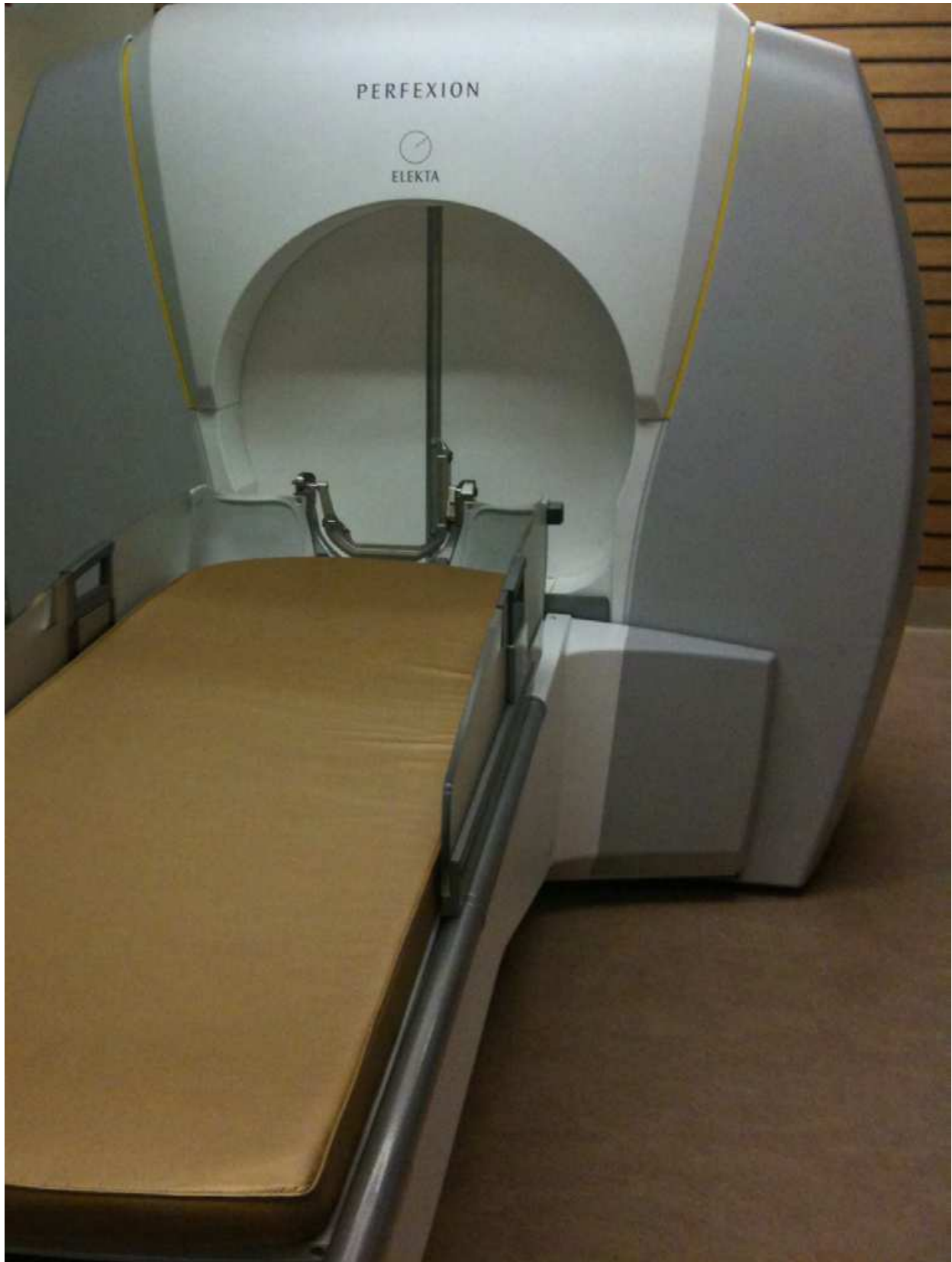
Fig. 1. Gamma Knife Perfexion Unit