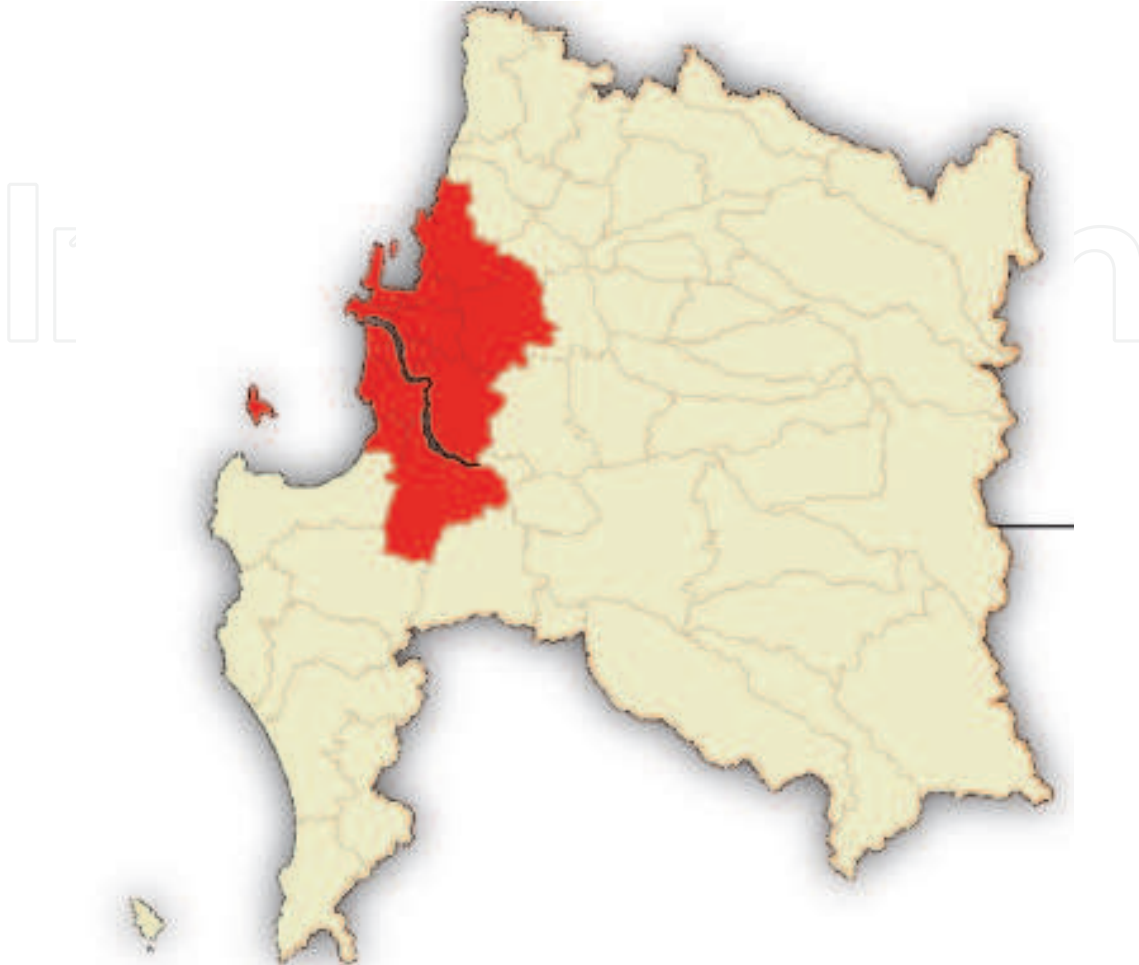
Fig. 1. Map of Chile. The red area on the map has been declared a non-attainment zone because of failure to maintain daily PM_{10} concentrations below a standard threshold. The area includes nine communities with a population of 1 million inhabitants.

(AIC), a measure of model prediction, or maximized the evidence that the model residuals did not display any type of structure, including serial correlation, using Bartlett's test (Lindstrom & Bates, 1990; Priestly, 1981). We plotted model residuals against time and found neither a pattern nor a significant correlation between air pollution and time. Once we had selected the optimal model for time, we assessed the value of including terms for the twenty-four hour means of temperature, humidity, and barometric pressure. The best meteorological predictors of death were temperature and humidity while humidex (Meteorological Service of Canada, 2000), a composite measure of temperature and humidity, was the best meteorological predictor of morbidity. We considered temperature and humidex readings on the day of death and the day prior to death and accounted for non-linear associations with death by using natural spline functions. Indicator functions for the day-of-the-week were also included. The association between air pollutants and death was tested at lags of zero to seven days and results were presented for the lags which maximized the effect size. Results from each urban center were pooled using a random effects model.