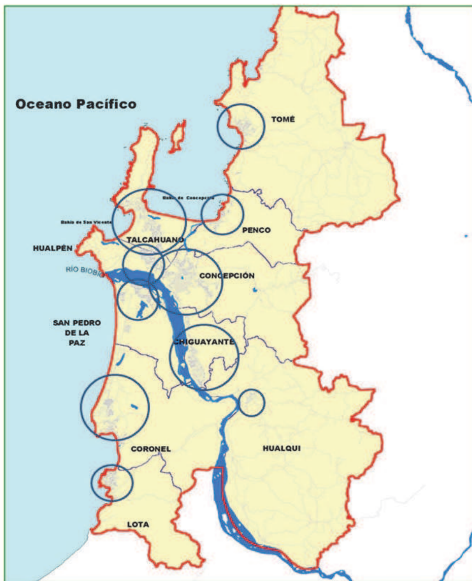
Fig. 2. Detailed Map of Chile. The locations of ten metropolitan areas highlighted in circles

Here we present the increase in relative risk (RR) of mortality or morbidity with 95% confidence intervals for an increase in PM_{10} concentration equal to the interquartile range of the pollutant's concentration over the period of study. The interquartile range includes the middle fifty-percent of the exposure data and provides a realistic estimate of the day-to-day changes in the pollutant's concentration. The interquartile range is a nonparametric measure of the data's spread and, as such, is not influenced by skewed data, extreme values or outliers which are unstable and infrequently seen. A random effects model was used to pool the estimates of relative risk following a DerSimonian- Laird test for homogeneity among estimates.