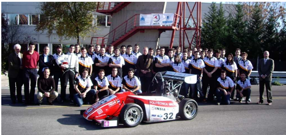
Fig. 8. Students and Faculty Advisors with the UPM'06.

To sum up, the educational experience provided by taking part in the project and the teaching methods used mean that the student must face up to specifically designed situations that will challenge them and promote their personal and professional skills. Table 7 shows 16 learning situations related to different moments or activities of the project, cross-referenced with 24 skills, which in the light of the literature consulted and the studies and surveys presented, are deemed to be the most sought after in an engineer getting ready to work in the automotive sector.