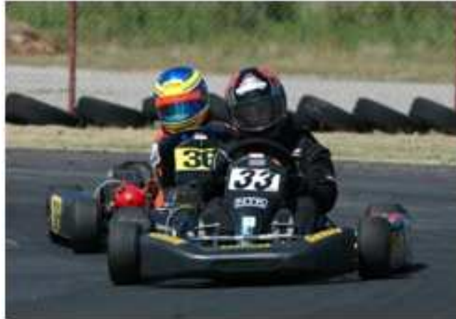
Fig. 6. Karting competition at Formula Low Cost s.

Formula Low Cost also provides an opportunity for students to participate throughout the life cycle of a real project, in order to prepare engineers to manage projects, budgets and learn to work as a part of a team. Table III shows the events with a brief description of each one.