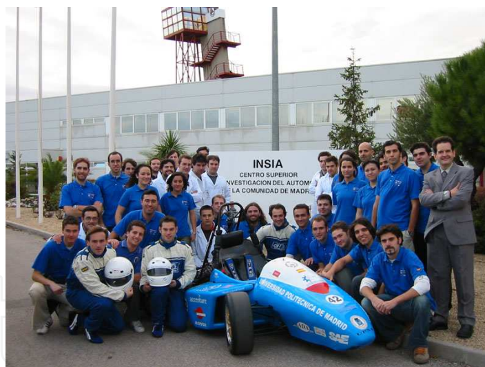
Fig. 7. The first team with the UPM-01 at INSIA-UPM.

UPMracing is the first Spanish Formula SAE competition team, and was founded on 2003 at the Madrid Polytechnic University, UPM. At that moment, a group of teachers and professors of the School of Industrial Engineering, ETSII-UPM, and researchers of the University Institute for Automobile Research, INSIA-UPM, selected this competition as the most complete. The team consisted of about 35 students from the final courses of ETSII and the Master's course in Automotive Engineering (Figure 7). In the years that followed, several students from other university schools joined in, like the Aeronautic Techniques and Industrial Techniques schools, what lead to important improvements in the performance (Figure 7).