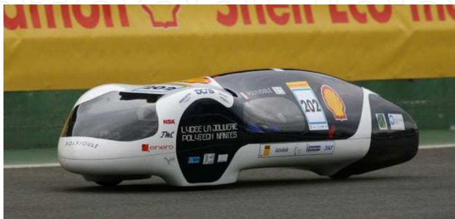
Fig. 3. Aerodynamics is an important goal at Ecoshell Marathon.