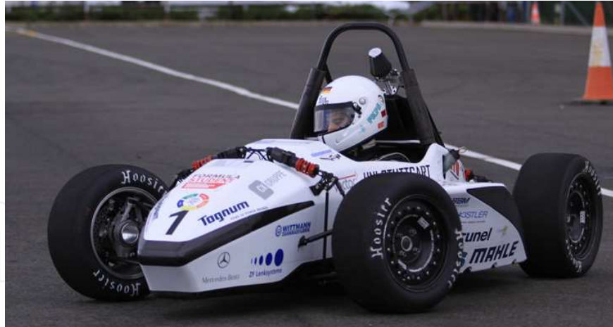
Fig. 1. Formula SAE car at competition.

engines which are standard engines of around 110 HP, but by restricting the air intake their capacity is reduced to around 70 HP after appropriately designing of the intake and exhaust with fluid dynamics programs and after electronically changing the engine torque and power curves.