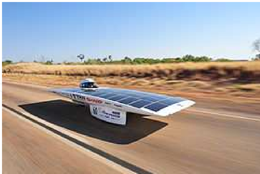
Fig. 5. WSC cars have large areas to place solar panels.

From an academic point of view, the goal is to encourage the students to put their efforts on developing a sustainable vehicle that is able to travel a distance of 3.000km in the shortest time using only sunlight as fuel. The competition take place in Australia and it is sponsored by Australian administrations. It usually takes three days to complete the distance, and there are not other events to evaluate the design concepts, sales or management skills.