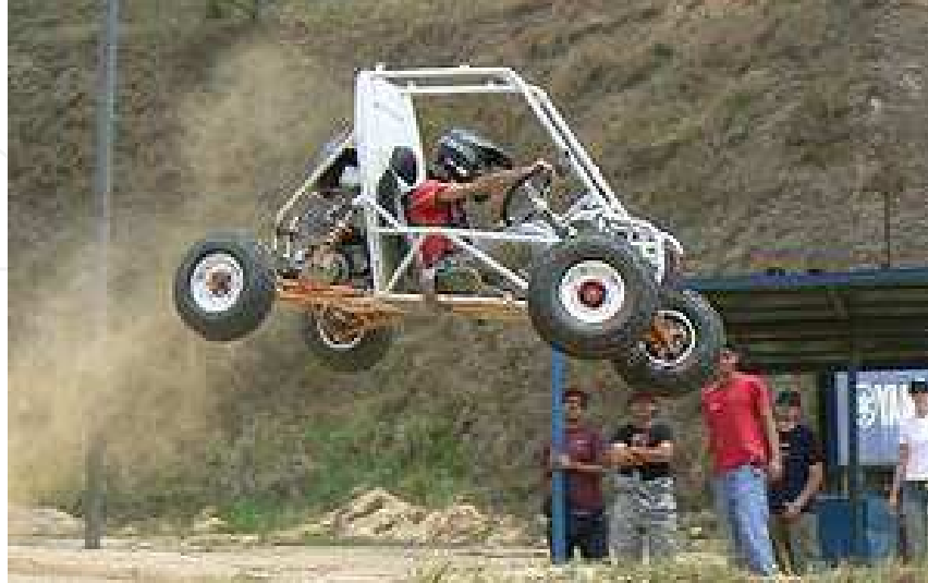
Fig. 2. Baja SAE vehicles have to overcome all kind of fields.

and the track is restricted to a maximum of 1900 mm. The cage in the chassis is very limited in terms of innovation to ensure the safety at all situations, as in the event of rollover or impacting with another vehicle.