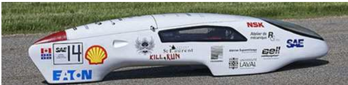
Fig. 4. Supermileage vehicle at competition.

Supermileage's objective goes in the same line as the previous competition, that is, developing a single person, extremely high mileage vehicle that complies with the organization rules. The competition intention passes through encourage the fuel economy. ( http://students.sae.org/competitions/supermileage/ ).