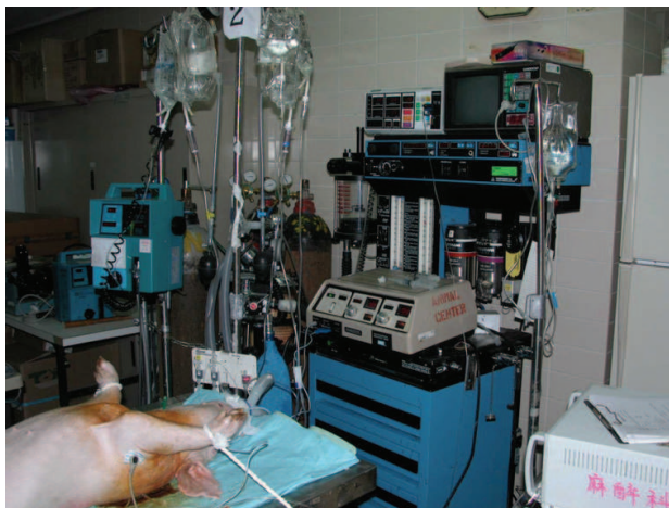
Fig. 1. Anesthesia and ventilator setting for experimental animals.

piglet was then intubated with an appropriately sized endotracheal tube (4.5–5.0; Mallinckrodt® endotracheal tubes, Nellcor, Boulder, CO). Mechanical ventilation was initiated with an infant ventilator (North American Drager Narcomed 2A; DRE Inc., Louisville, KY) with oxygen gas (50% FiO 2 ) at a peak inspiratory pressure of 15 cmH 2 O, inspiratory time of 0.75 s, a positive-end-expiratory-pressure of 5 cmH 2 O, and a respiratory rate of 12 breaths per min. We measured the ABG intermittently and adjusted the peak pressure to maintain normocapnia (PaCO 2 35–45 mmHg) during the baseline period. End-tidal CO 2 from the endotracheal humidity cuff was continuously monitored. Following intubation, the piglet was regularly paralyzed with intravenous pancuronium (100 µg/kg), and anesthesia was maintained with 2%–3% isoflurane (250 mL; Forane, Abbott Laboratories Ltd., Queenborough, Kent, UK). (Figure 1)