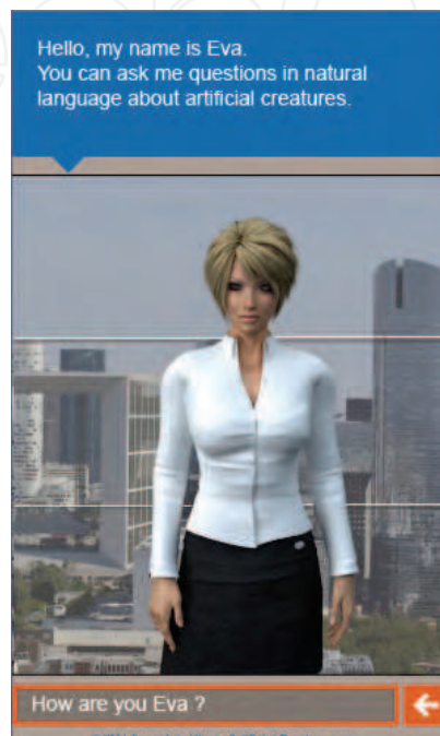
Fig. 3. The graphical interface showing the self-animated 3D character.

The prototype included also three agents for implementing the graphical interface. They controlled the following tasks: (1) get the user entries and diffuse them to the local nano-agents, (2) display the resulting answer in the appropriate window area ; (3) receive the character animation commands and apply them. In the experiments, the character animation is based on a reduced set of pre-computed 3D clips, each one corresponding to a given situation: "hello", "bye", "waiting", "speaking", "surprised" and one for each main mood (cf. section 4.3).