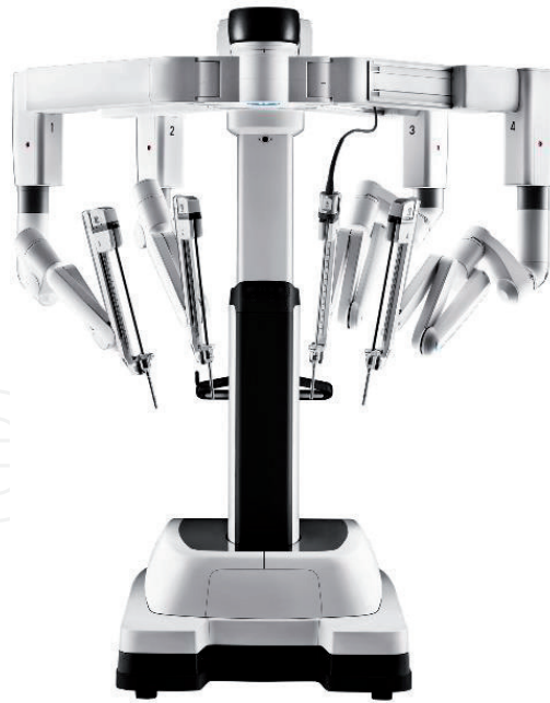
Figure 1. Da Vinci XI patient cart with four robotic arms.

arms with three-dimensional controls which translate the surgeon's hand movements to the wristed instruments on each of the robotic arms. A RATS platform aids the surgeon by enhancing visualization with a three-dimensional high-definition view, minimizing hand tremors, and improving dexterity of the instruments by functioning with multiple degrees of freedom. Wristed instruments mimic the surgeon's actual hand movements, simulating open surgery, allowing for the precise dissection of vascular structures and a thorough lymphadenectomy, key steps to success when performing minimally invasive lung resection. While this technique is a dramatic change from either open or VATS procedures as the surgeon is not at the patient's bedside, repetition and the frequency of performing robotic cases helps one's personal comfort as they transition to RATS.