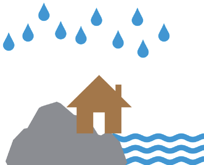
Figure 2. Hazard, risk, and vulnerability illustrated.

Vulnerability and resilience. Represented by the strength or weakness of the walls, the stability or instability of the foundation, the rising waters, etc.