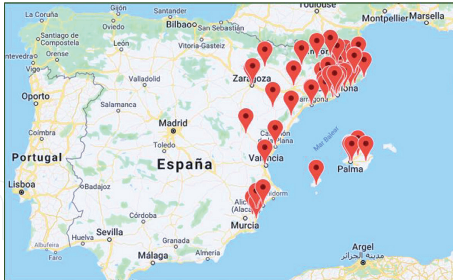
Figure 1. Centers of the Antidotes Network in Spain.