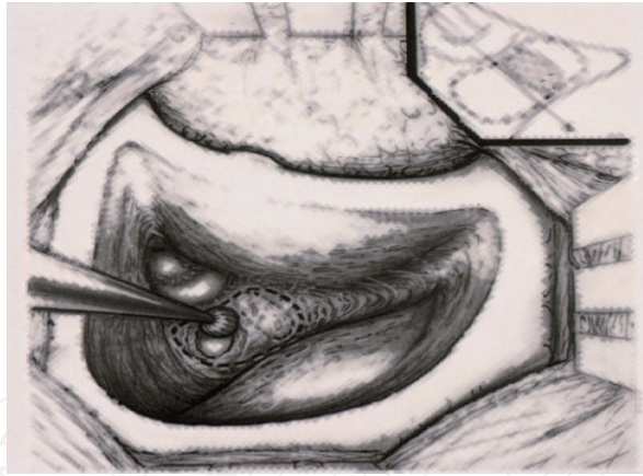
Figure 3. Schematic drawing of Labyrinthectomy.

Giddings et al. [50] reported hearing loss after cochleo-sacculotomy in 80% of the patients and recurrent vertigo episodes in a mean follow-up of 17 months in 4 of 11 patients so that a destructive intervention had to be carried out again. Kinney et al. [51] and Wielinga et al. [52] recommended cochleo-sacculotomy as a minimally invasive surgical method, especially for old patients, as an alternative to neurectomy because good results were obtained with regard to vertigo control, although with significant hearing loss in almost all patients.