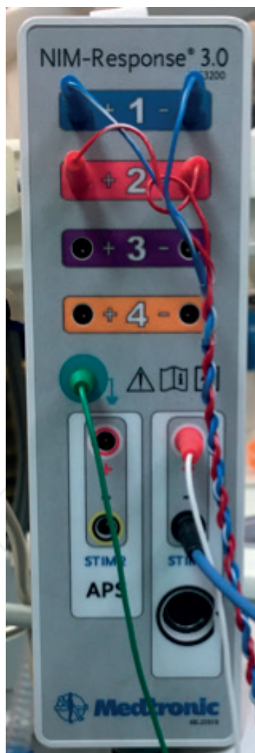
Figure 3. Stimulation and recording sides are combined on the interconnect box, through which they connect to the monitor.

recording side, instead, consists of the ET tube with surface electrodes, which are placed at the level of the vocal cord, and their ground electrode ( Figure 2 ). These two main systems combine on the interconnection box ( Figure 3 ), through which