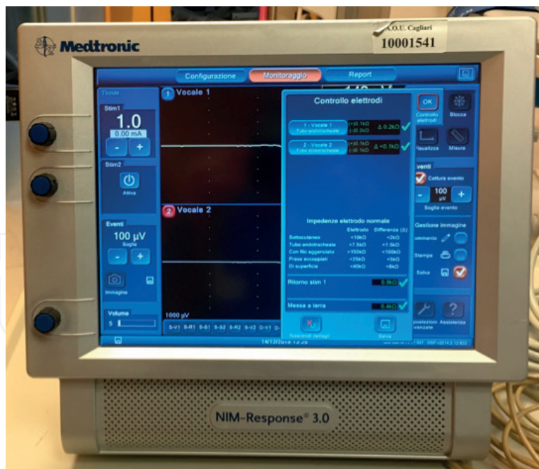
Figure 4. Check of the impedance value of the electrodes from the monitor.

tests to verify the correct location of the ET tube include the evaluation of respiratory changes or a further laryngoscopy. About the first method, in the short-term window period between the loss of the effect of short-acting NMBA and the deepening of anesthesia following intubation, spontaneous respiratory movements should result in waveforms with an amplitude of 30–70 \mu\text{V} on the monitor. These respiratory changes should be detected for both vocal cords.