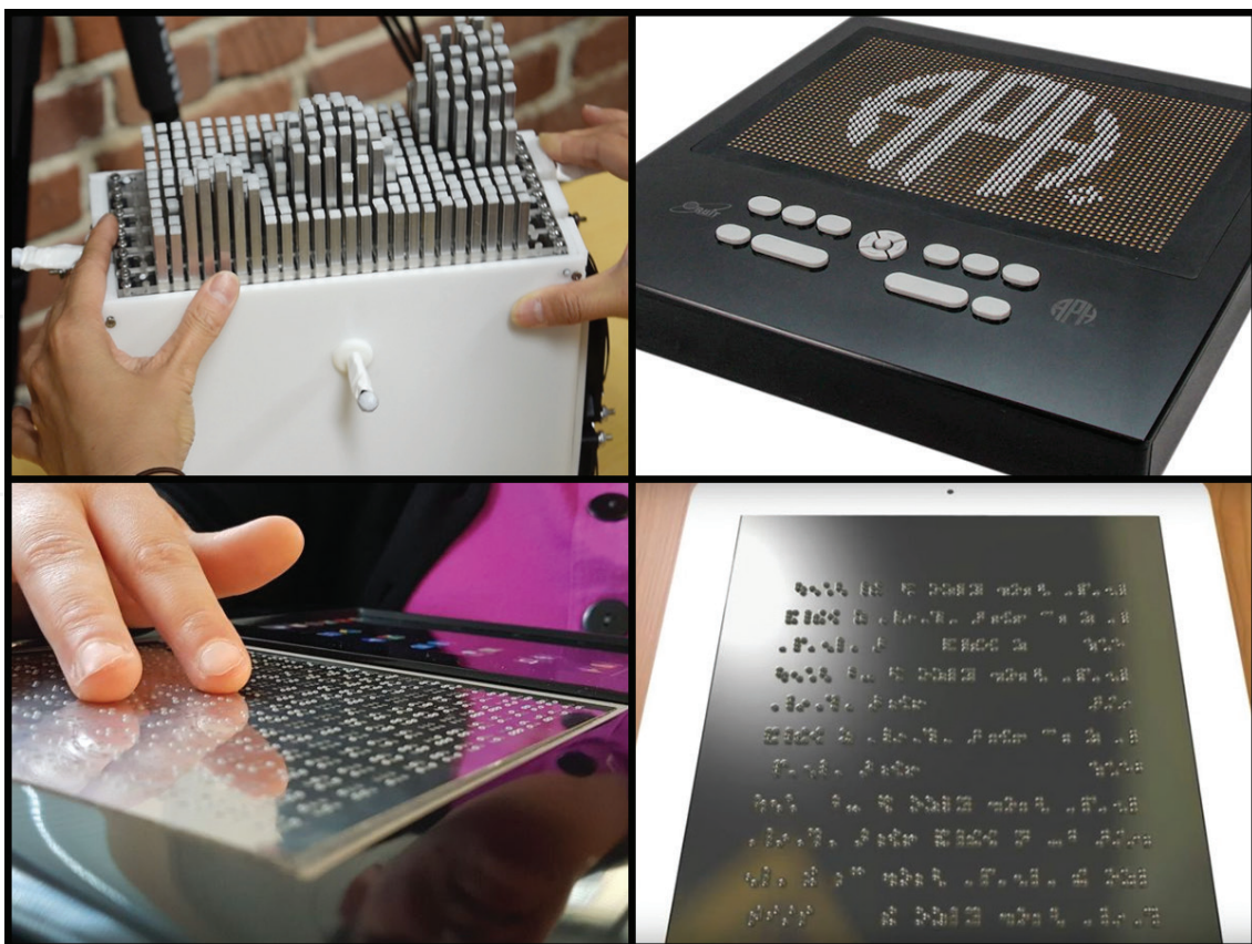
Figure 2. New innovative solutions being developed for individuals with BVI: upper left—demonstration of shapeShift (multi-height pin array) [39]; upper right—Graphiti (refreshable pin array) [37]; lower left—BLITAB (refreshable pin tablet) [38]; and lower right—Holy Braille (microfluidic tablet) [40].

While the above innovative approaches have various benefits, we posit that a more broadly adoptable solution is to use technology that: (1) provides direct perceptual access to the graphical content, as is the case via visual access, (2) is (or could be) mass marketed and readily available among end users, and (3) is based on a computational platform that can be leveraged for other functions/activities. We argue that this is best accomplished using dynamic touch-based (or multimodal) displays implemented on smart devices (phones/tablets). We believe that interfaces leveraging direct touch access are critical in solving the graphical access problem as touch has much in common with visual spatial perception, sharing many parallels with the visual pathways in the brain (e.g., [41, 42]). For example, both modalities extract the basic features and spatiality of an object in the environment and integrate this information to form a complete, coherent representation of the object