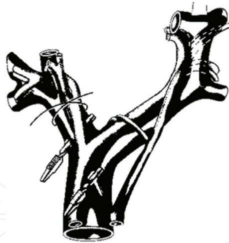
Figure 1. Control of the arterial and portal components without touching the biliary duct.

The control of right hepatic vein can also be done at this stage, however, this is not essential and should be avoided if difficulties are anticipated. This technique has the advantage of preceding the parenchymal section by the selective control of the right arteriportal and right hepatic components (as in the technique described by Lortat-Jacob) [5] and tie the vessels in the hepatic parenchyma (as in the technique described by Ton That Tung) [6].