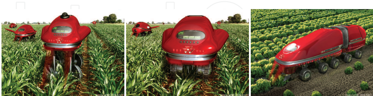
Fig 1. MF-Scamp robots for scouting, weeding and harvesting (Designed by Blackmore. Copyright©2008 AGCO Ltd)

efficient to replace the traditional large tractors. These vehicles should be able to carry out useful tasks all year round, unattended and able to behave sensibly in a semi-natural environment over long periods of time. The small vehicles may also have less environmental impact replacing the over-application of chemicals and fertilizers, requiring lower usage of energy with better control matched to requirements, as well as causing less soil compaction due to lighter weight.