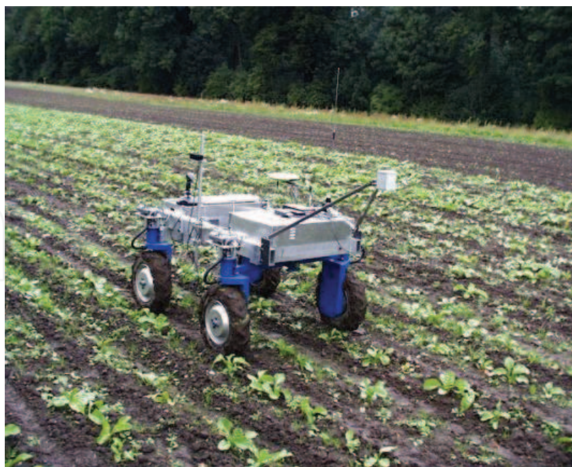
Fig. 3. The API platform.

In this scenario, the area for field scouting and weed mapping is limited to 500 ha to match large production units with the necessary flexibility. We have focused on cereal crops but it may also be relevant for other crops such as high value crops like sugar beet, potatoes or other horticultural crops. However, the shorter the time for carrying out the activity, the lower the overall capacity required.