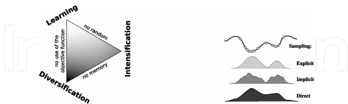
Figure 1. The three classes of metaheuristics proposed in adaptive learning search are defined according to the sampling of the objective function. They combine themselves with the three archetypal components, that form the set of possible behaviours

Metaheuristics form a wide class of methods, among which the more interesting are often stochastic algorithms manipulating a sample of points (also called a "population" of "individuals"). In this section, we will briefly introduce some of the best known metaheuristics, from the simulated annealing (which does not use swarm intelligence) to ant colony algorithms (a method well known for using swarm intelligence). Each metaheuristic is here described along with its position regarding adaptive learning search and swarm intelligence.