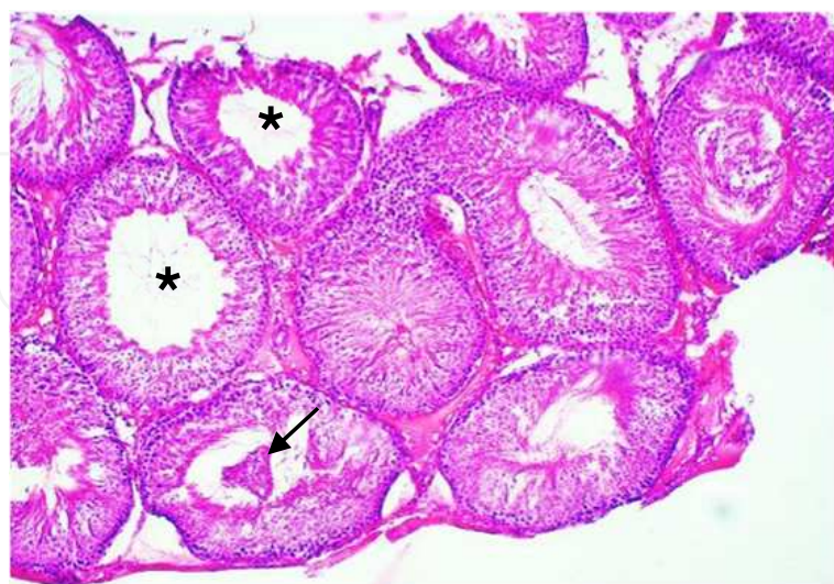
Figure 3. Representative histological section of testis from aminocarb-exposed rat (40 mg/kg/body weight) during 14 days. Immature germ cells (arrow) within the lumen of seminiferous tubules; some tubules (*) denoted a decrease on germ cell layers; haematoxylin-eosin stain. Original magnification: \times 100 .