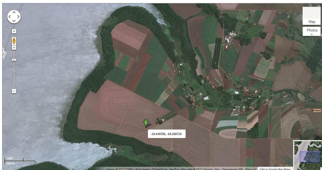
Figure 3. Local where the experiment involving fertilization with Zn in corn crop was performed [80]

used in the work, it was observed that one of the sources presented 11039.46 \text{ mg of Pb kg}^{-1} , being the maximum limit permitted by Brazilian law (NI 27/06) [37] 10000.00 \text{ mg of Pb kg}^{-1} (Table 3). However, as previously mentioned in the section 3, the NI 27/06 tolerates the presence of contaminants up to 30% of the maximum permitted value, in this way, the fertilizer would not be considered as irregular, and can be freely traded.