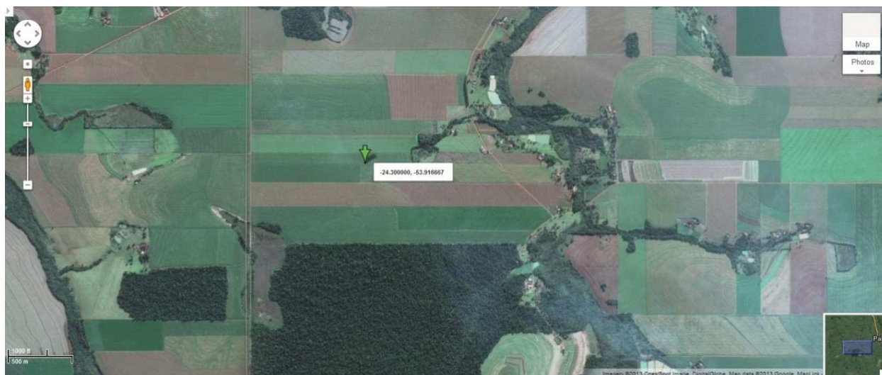
Figure 2. Local where the experiment involving fertilization with Zn in soybean and wheat culture were performed [80]

used in the work, it was observed that one of the sources presented 11039.46 \text{ mg of Pb kg}^{-1} , being the maximum limit permitted by Brazilian law (NI 27/06) [37] 10000.00 \text{ mg of Pb kg}^{-1} (Table 3). However, as previously mentioned in the section 3, the NI 27/06 tolerates the presence of contaminants up to 30% of the maximum permitted value, in this way, the fertilizer would not be considered as irregular, and can be freely traded.